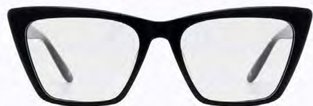
CL4204 OPT 01

Frame Color: Black Lens Color: 0 Frame Material: Hand made - Acetate Handle Length: 145 Lens Width: 52 Nose Bridge: 17