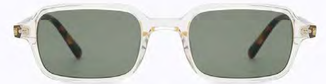
CL9185 SG 03

Frame Color: Trans light champagne Lens Color: G15 Frame Material: Hand made - Acetate Handle Length: 145 Lens Width: 49 Nose Bridge: 20