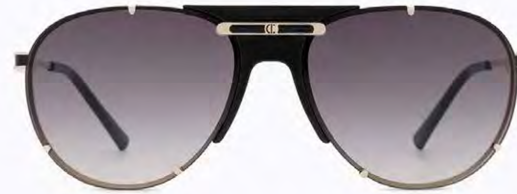
CL3278 SG 02

Frame Color: shiny light gold/shiny black Lens Color: Gradient smoke Frame Material: Metal Handle Length: 145 Lens Width: 60 Nose Bridge: 17