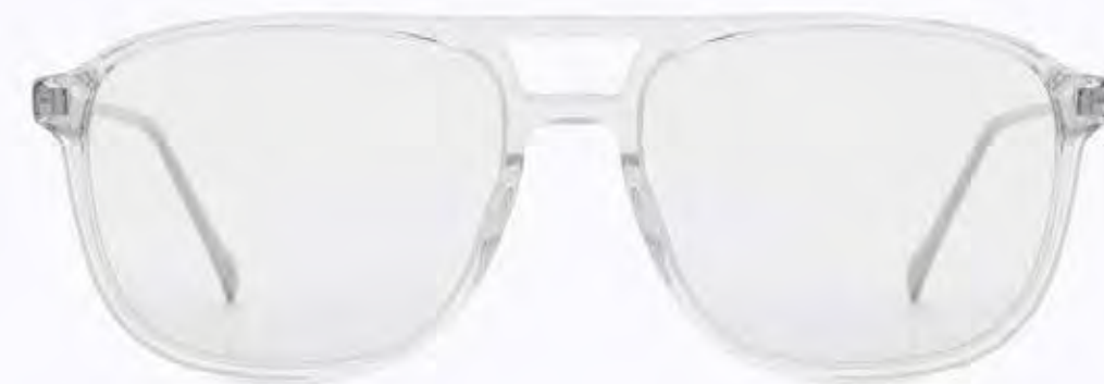
CL4189 OPT 03

Frame Color: Transparent Lens Color: 0 Frame Material: Hand made - Acetate Handle Length: 145 Lens Width: 54 Nose Bridge: 16