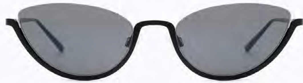
CL3287 SG 01

Frame Color: Shiny Black Lens Color: Smoke Frame Material: Metal Handle Length: 135 Lens Width: 57 Nose Bridge: 20