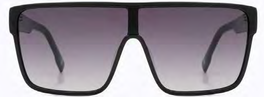
CL9134 SG 01

Frame Color: Shiny Black Lens Color: Gradient smoke Frame Material: Hand made - Acetate Handle Length: 145 Lens Width: 137 Nose Bridge: 0