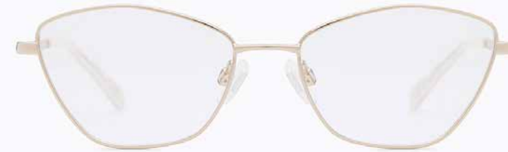
CL4281 OPT 02

Frame Color: Shiny light gold Lens Color: 0 Frame Material: Metal Handle Length: 145 Lens Width: 53 Nose Bridge: 17