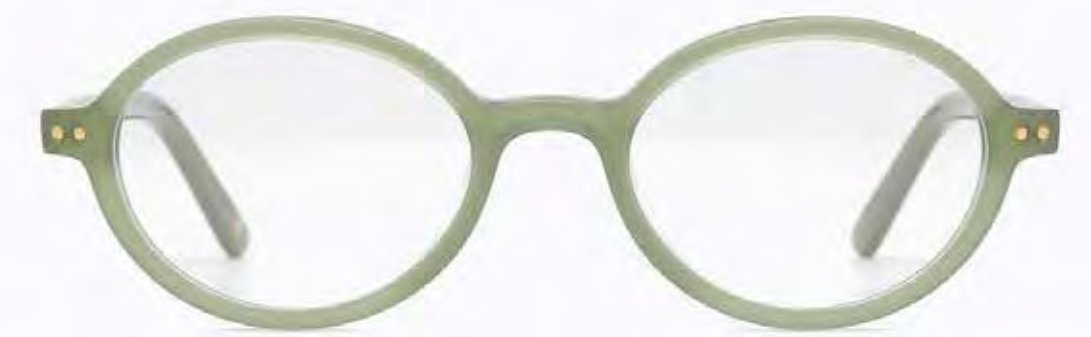
CL4207 OPT 03

Frame Color: Milky olive green Lens Color: 0 Frame Material: Hand made - Acetate Handle Length: 145 Lens Width: 49 Nose Bridge: 19