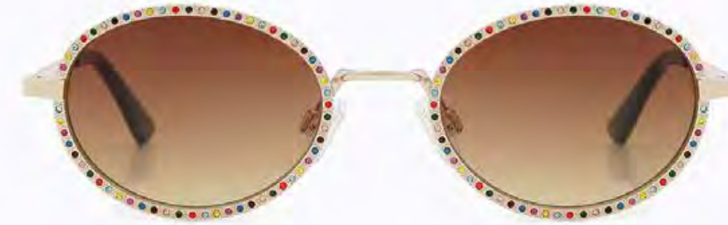
CL3165 SG OPT 02

Frame Color: shiny gold with colorful stones Lens Color: Gradient brown Frame Material: Metal Handle Length: 140 Lens Width: 47 Nose Bridge: 20