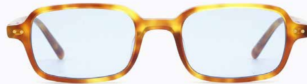
CL9185 SG 02

Frame Color: Yellow brown demi Lens Color: solid light neon blue Frame Material: Hand made - Acetate Handle Length: 145 Lens Width: 49 Nose Bridge: 20