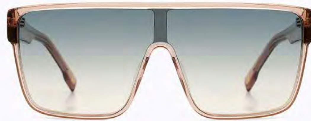
CL9134 SG 02

Frame Color: Dark trans champagne Lens Color: Gradient green to yellow Frame Material: Hand made - Acetate Handle Length: 145 Lens Width: 137 Nose Bridge: 0