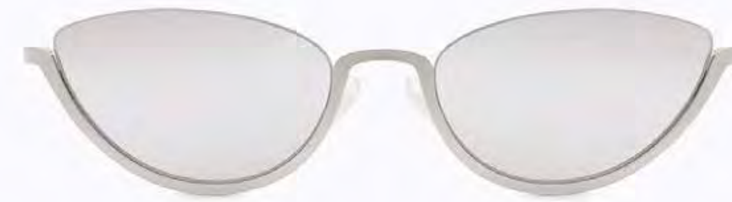
CL3287 SG 02

Frame Color: Shiny Black Lens Color: Silver mirror-smoke Frame Material: Metal Handle Length: 135 Lens Width: 57 Nose Bridge: 20