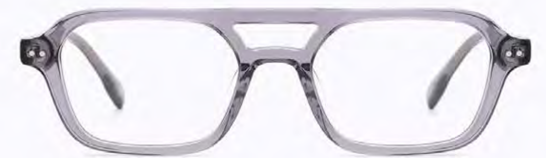
CL4316 OPT 03

Frame Color: Transparent dark grey Lens Color: 0 Frame Material: Hand made - Acetate Handle Length: 145 Lens Width: 51 Nose Bridge: 19