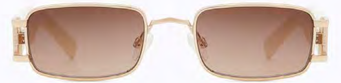
CL3220 SG 03

Frame Color: Shiny light gold Lens Color: Gradient brown Frame Material: Metal Handle Length: 145 Lens Width: 49 Nose Bridge: 20