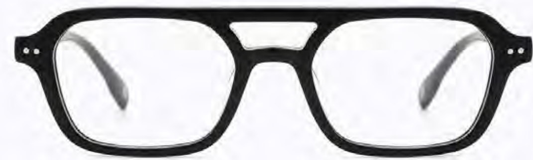
CL4316 OPT 01

Frame Color: Black Lens Color: 0 Frame Material: Hand made - Acetate Handle Length: 145 Lens Width: 51 Nose Bridge: 19