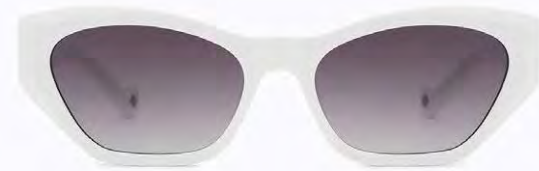
CL9133 SG BIO 02

Frame Color: white Lens Color: Smoke Frame Material: Hand made- Acetate Handle Length: 145 Lens Width: 54 Nose Bridge: 18