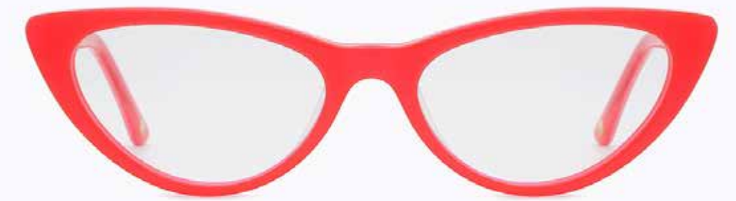
CL4213 OPT 03

Frame Color: Neon pink light pink Lens Color: 0 Frame Material: Hand made - Acetate Handle Length: 145 Lens Width: 53 Nose Bridge: 17