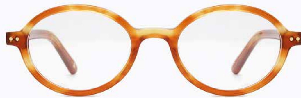
CL4207 OPT 02

Frame Color: Yellow orange demi Lens Color: 0 Frame Material: Hand made - Acetate Handle Length: 145 Lens Width: 49 Nose Bridge: 19