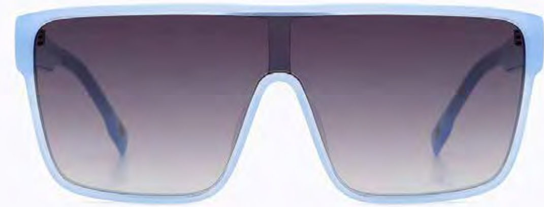
CL9134 SG 04

Frame Color: milky light blue Lens Color: gradient smoke Frame Material: Hand made - Acetate Handle Length: 145 Lens Width: 137 Nose Bridge: 0