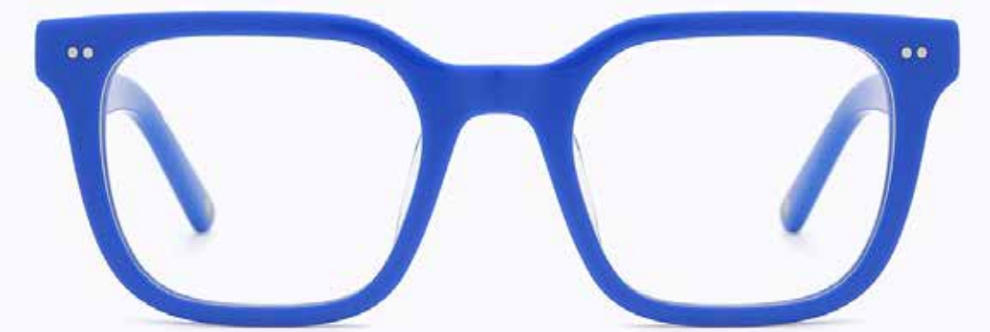
CL4250 OPT 05

Frame Color: Blue Lens Color: 0 Frame Material: Hand made - Acetate Handle Length: 145 Lens Width: 49 Nose Bridge: 21