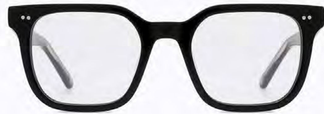
CL4250 OPT 01

Frame Color: Black Lens Color: 0 Frame Material: Hand made - Acetate Handle Length: 145 Lens Width: 49 Nose Bridge: 21