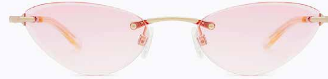
CL3288 SG 02

Frame Color: Gold Lens Color: Gradient pink to trans Frame Material: Hand made - Acetate Handle Length: 145 Lens Width: 46 Nose Bridge: 22