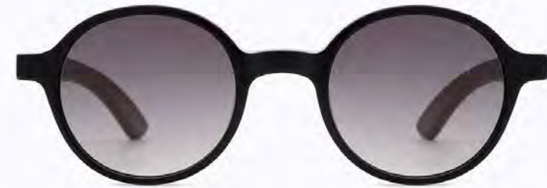
CL9167 SG WT 01

Frame Color: Shiny black Lens Color: Gradient smoke Frame Material: Hand made - Acetate Handle Length: 145 Lens Width: 46 Nose Bridge: 22