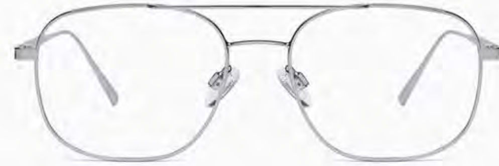
CL4164 OPT 02

Frame Color: Yellow orange demi Lens Color: 0 Frame Material: Metal Handle Length: 145 Lens Width: 53 Nose Bridge: 17