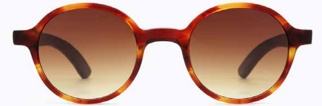
CL9167 SG WT 03

Frame Color: Yellow orange demi Lens Color: Gradient brown Frame Material: Hand made - Acetate Handle Length: 145 Lens Width: 46 Nose Bridge: 22