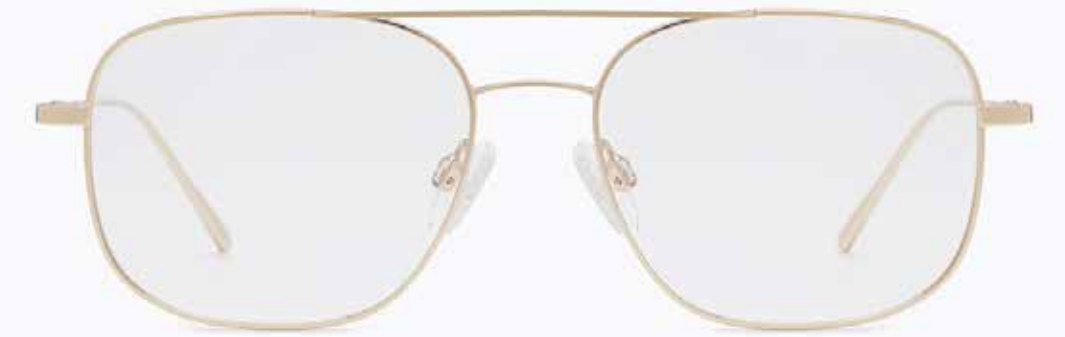
CL4164 OPT 03

Frame Color: Milky olive green Lens Color: 0 Frame Material: Metal Handle Length: 145 Lens Width: 53 Nose Bridge: 17