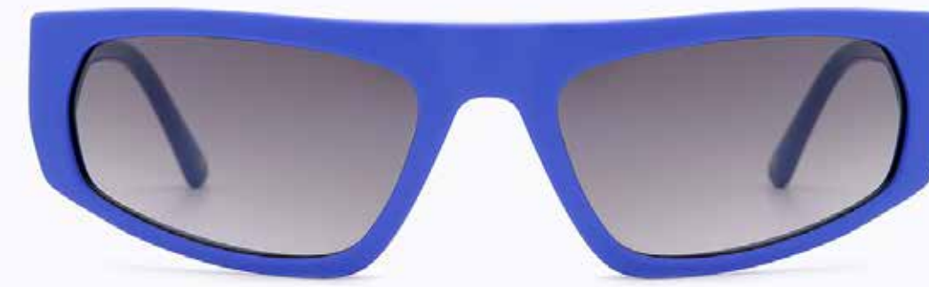
CL9151 SG 02

Frame Color: blue Lens Color: Gradient smoke Frame Material: Hand made - Acetate Handle Length: 145 Lens Width: 56 Nose Bridge: 19