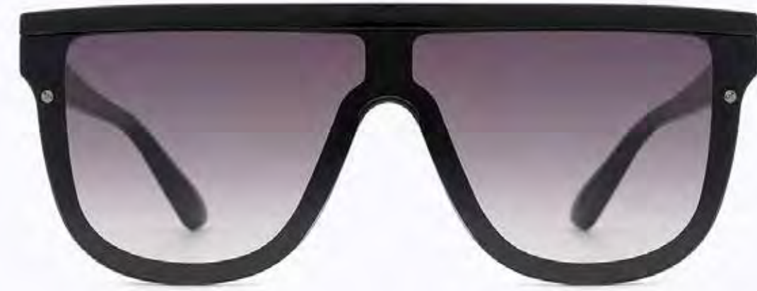
CL3258 SG 01

Frame Color: Shiny Black Lens Color: Gradient smoke Frame Material: T.R. 90 Handle Length: 145 Lens Width: 146 Nose Bridge: 0