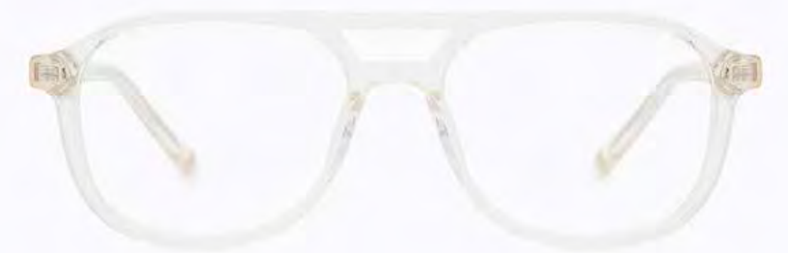
CL4263 OPT 03

Frame Color: Trans light champagne Lens Color: 0 Frame Material: Hand made- Acetate Handle Length: 145 Lens Width: 52 Nose Bridge: 17