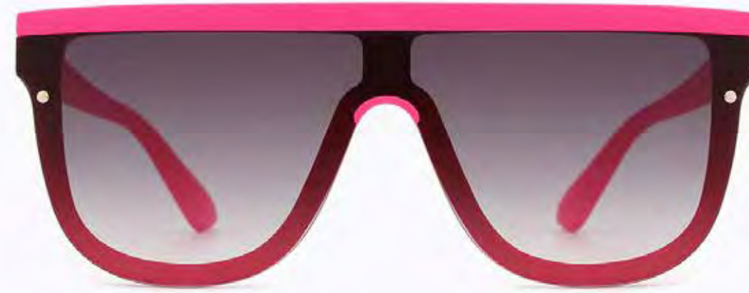
CL3258 SG 02

Frame Color: Matt neon pink Lens Color: Gradient smoke Frame Material: T.R. 90 Handle Length: 145 Lens Width: 146 Nose Bridge: 0