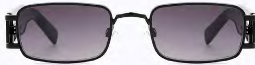
CL3220 SG 02

Frame Color: Shiny Black Lens Color: Gradient smoke Frame Material: Metal Handle Length: 145 Lens Width: 49 Nose Bridge: 20