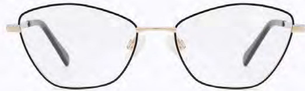
CL4281 OPT 01

Frame Color: Shiny light gold/shiny black Lens Color: 0 Frame Material: Metal Handle Length: 145 Lens Width: 53 Nose Bridge: 17