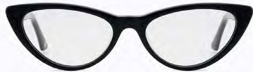
CL4213 OPT 01

Frame Color: Black Lens Color: 0 Frame Material: Hand made - Acetate Handle Length: 145 Lens Width: 53 Nose Bridge: 17