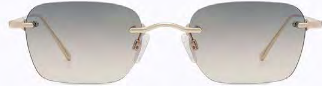
CL6800 SG 04

Frame Color: Gold Lens Color: Green to yellow Frame Material: Metal Handle Length: 145 Lens Width: 46 Nose Bridge: 22