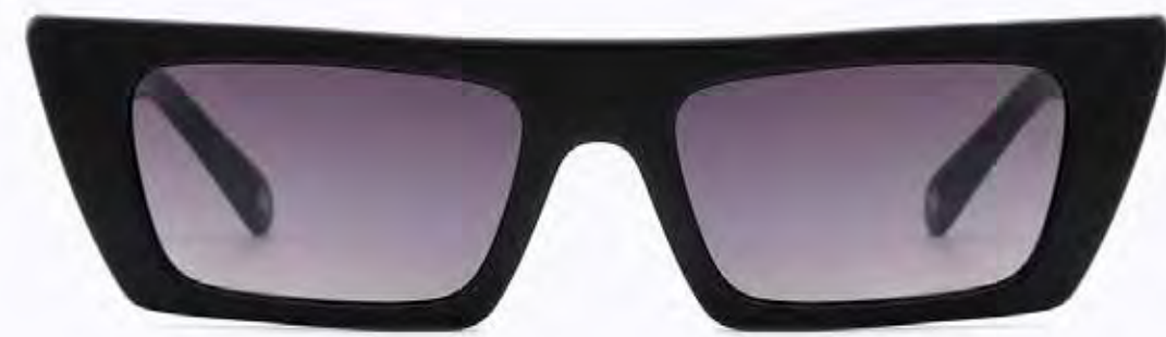
CL9150 SG BIO 01

Frame Color: Black Lens Color: Gradient smoke Frame Material: Hand made-Bio acetate Handle Length: 145 Lens Width: 54 Nose Bridge: 19