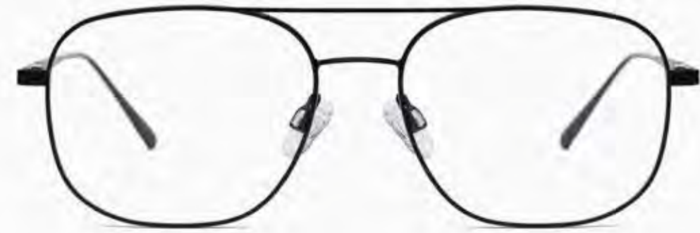
CL4164 OPT 01

Frame Color: Shiny black Lens Color: 0 Frame Material: Metal Handle Length: 145 Lens Width: 53 Nose Bridge: 17