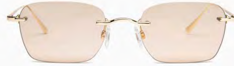
CL6800 SG 07

Frame Color: Gold Lens Color: Light brown with gold mirror Frame Material: Metal Handle Length: 145 Lens Width: 46 Nose Bridge: 22