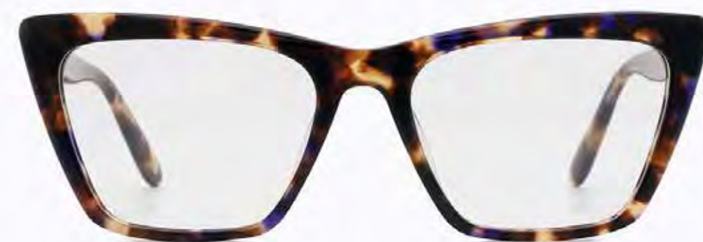
CL4204 OPT 02

Frame Color: Brown beige blue demi Lens Color: 0 Frame Material: Hand made - Acetate Handle Length: 145 Lens Width: 52 Nose Bridge: 17