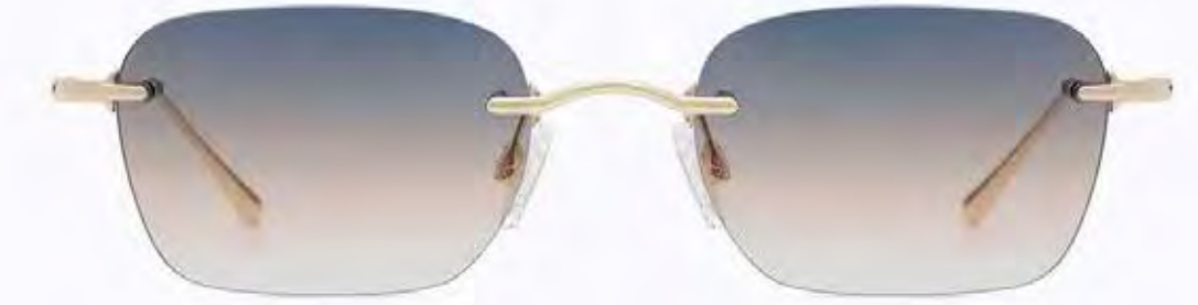
CL6800 SG 11

Frame Color: Gold Lens Color: gradient smoke Frame Material: Metal Handle Length: 145 Lens Width: 46 Nose Bridge: 22