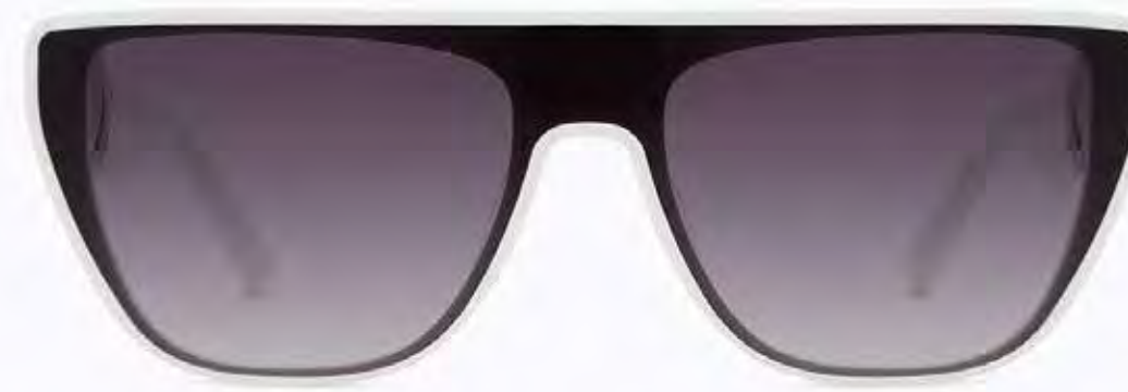
CL9176 SG 02

Frame Color: white Lens Color: gradient smoke Frame Material: Hand made - Acetate Handle Length: 145 Lens Width: 137 Nose Bridge: 0