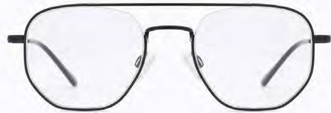
CL4267 OPT 01

Frame Color: Black Lens Color: 0 Frame Material: Metal Handle Length: 145 Lens Width: 49 Nose Bridge: 20