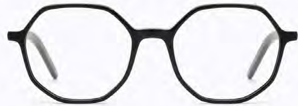
CL4255 OPT 01

Frame Color: Shiny black Lens Color: 0 Frame Material: Hand made - Acetate Handle Length: 140 Lens Width: 51 Nose Bridge: 18