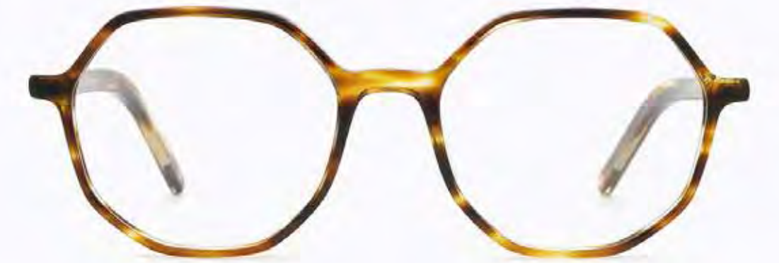
CL4255 OPT 03

Frame Color: Brown stripes demi Lens Color: 0 Frame Material: Hand made - Acetate Handle Length: 140 Lens Width: 51 Nose Bridge: 18