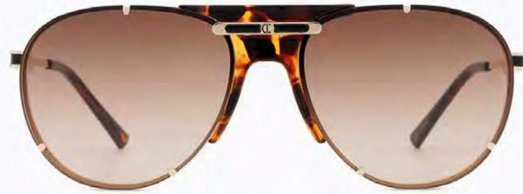
CL3278 SG 01

Frame Color: shiny light gold/shiny demi Lens Color: Gradient dark brown/light brown Frame Material: Metal Handle Length: 145 Lens Width: 60 Nose Bridge: 17