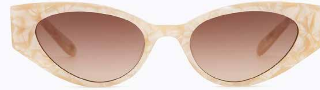
CL9180 SG BIO 02

Frame Color: Marble nude Lens Color: Smoke Frame Material: Gradient dark brown/light brown Handle Length: 145 Lens Width: 51 Nose Bridge: 19