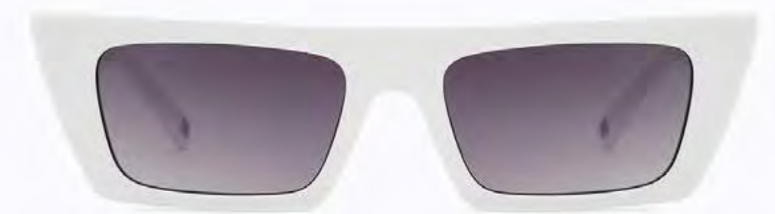
CL9150 SG BIO 03

Frame Color: White Lens Color: Gradient smoke Frame Material: Hand made-Bio acetate Handle Length: 145 Lens Width: 54 Nose Bridge: 19