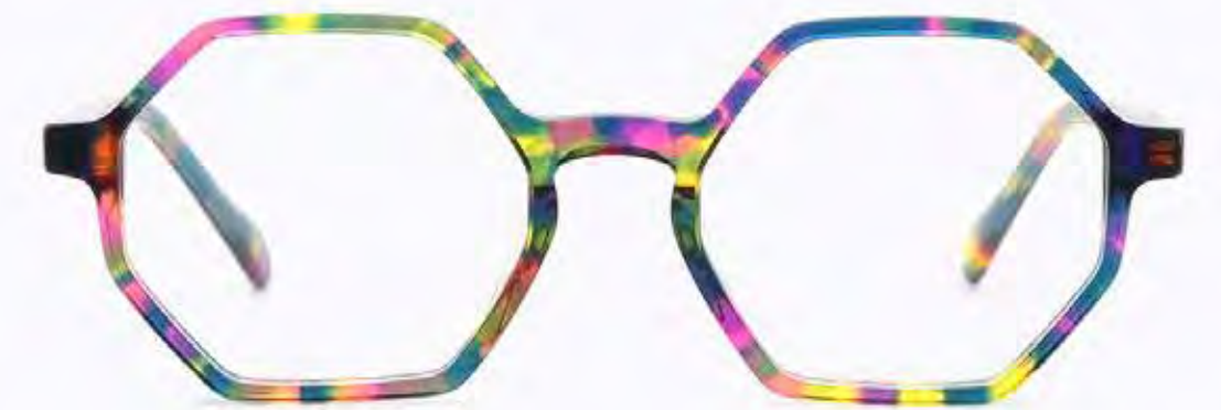
CL4256 OPT 03

Frame Color: Colorful demi Lens Color: 0 Frame Material: Hand made - Acetate Handle Length: 145 Lens Width: 49 Nose Bridge: 19