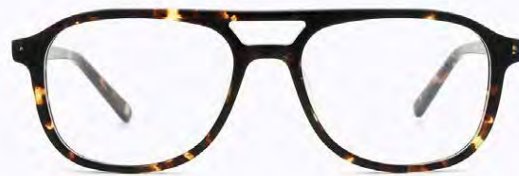
CL4263 OPT 02

Frame Color: Black light yellow demi Lens Color: 0 Frame Material: Hand made- Acetate Handle Length: 145 Lens Width: 52 Nose Bridge: 17