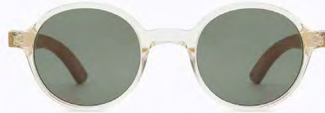
CL9167 SG WT 02

Frame Color: Shiny trasn l.champagne Lens Color: G15 Frame Material: Hand made - Acetate Handle Length: 145 Lens Width: 46 Nose Bridge: 22