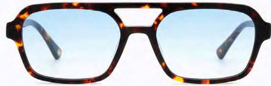
CL9138 SG 02

Frame Color: Demi Lens Color: Gradient blue to transparent Frame Material: Hand made- Acetate Handle Length: 145 Lens Width: 55 Nose Bridge: 18