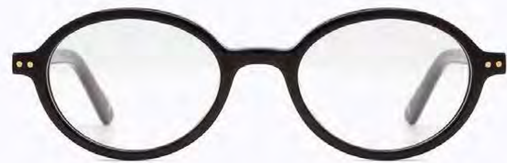
CL4207 OPT 01

Frame Color: Shiny black Lens Color: 0 Frame Material: Hand made - Acetate Handle Length: 145 Lens Width: 49 Nose Bridge: 19