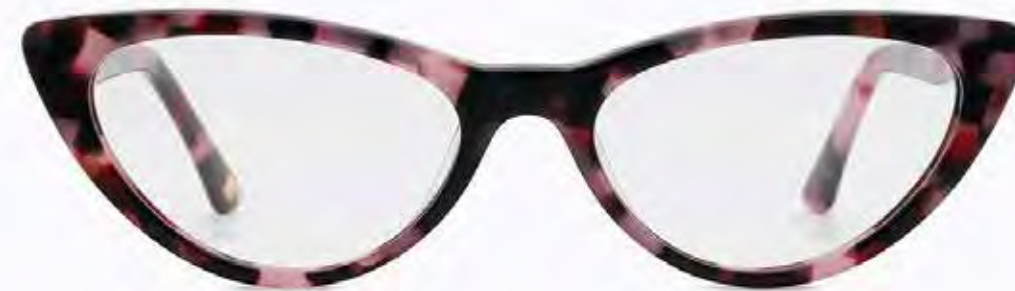
CL4213 OPT 02

Frame Color: Red purple pink demi Lens Color: 0 Frame Material: Hand made - Acetate Handle Length: 145 Lens Width: 53 Nose Bridge: 17