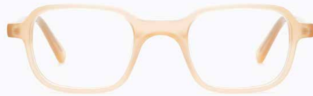
CL4317 OPT 03

Frame Color: Milky peach Lens Color: 0 Frame Material: Hand made - Acetate Handle Length: 145 Lens Width: 46 Nose Bridge: 22