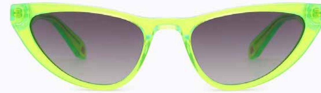
CL9170 SG 02

Frame Color: Neon trans green Lens Color: Gradient smoke Frame Material: Hand made - Acetate Handle Length: 145 Lens Width: 55 Nose Bridge: 20