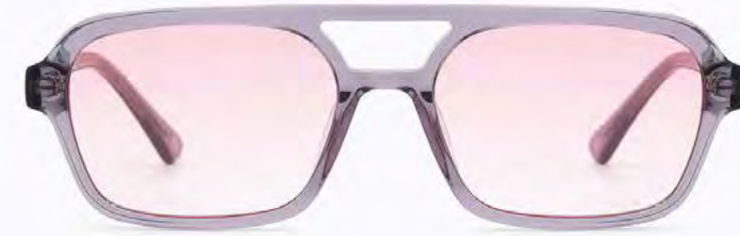
CL9138 SG 05

Frame Color: Transparent dark grey Lens Color: Gradient pink to trans Frame Material: Hand made - Acetate Handle Length: 145 Lens Width: 55 Nose Bridge: 18