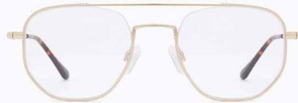
CL4267 OPT 02

Frame Color: Demi 1YWP4B002 Lens Color: 0 Frame Material: Metal Handle Length: 145 Lens Width: 49 Nose Bridge: 20