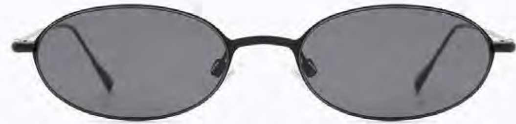
CL3268 SG 01

Frame Color: Matt black Lens Color: Smoke Frame Material: Metal Handle Length: 145 Lens Width: 46 Nose Bridge: 22