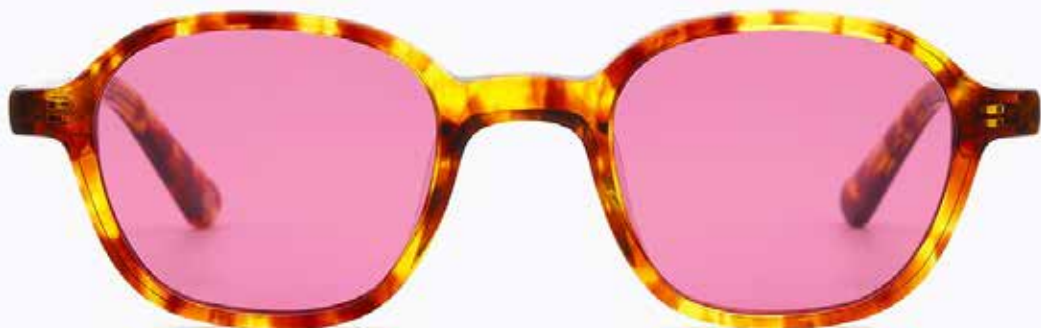
CL9154 SG 02

Frame Color: yellow demi Lens Color: yuval purple Frame Material: Hand made - Acetate Handle Length: 145 Lens Width: 46 Nose Bridge: 22