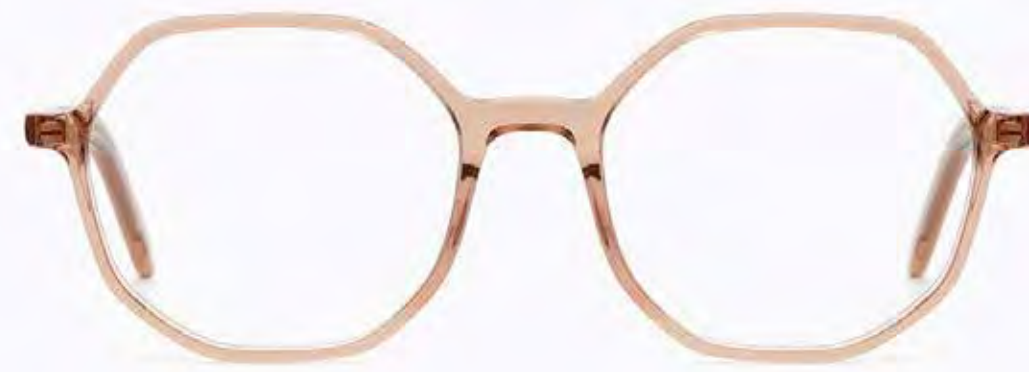
CL4255 OPT 02

Frame Color: Light trans brown Lens Color: 0 Frame Material: Hand made - Acetate Handle Length: 140 Lens Width: 51 Nose Bridge: 18