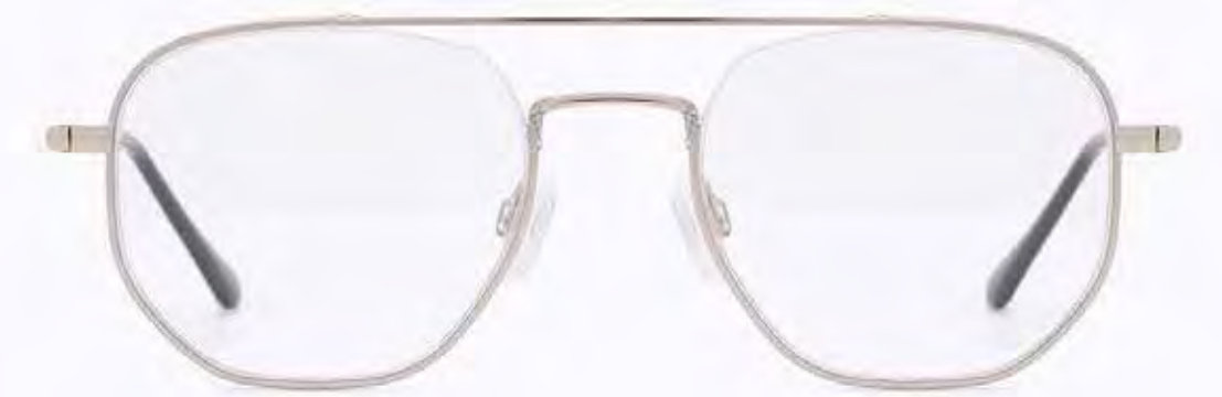
CL4267 OPT 03

Frame Color: Transparent dark grey Lens Color: 0 Frame Material: Metal Handle Length: 145 Lens Width: 49 Nose Bridge: 20