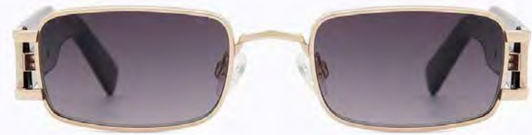
CL3220 SG 01

Frame Color: Shiny light gold Lens Color: Gradient smoke Frame Material: Metal Handle Length: 145 Lens Width: 49 Nose Bridge: 20