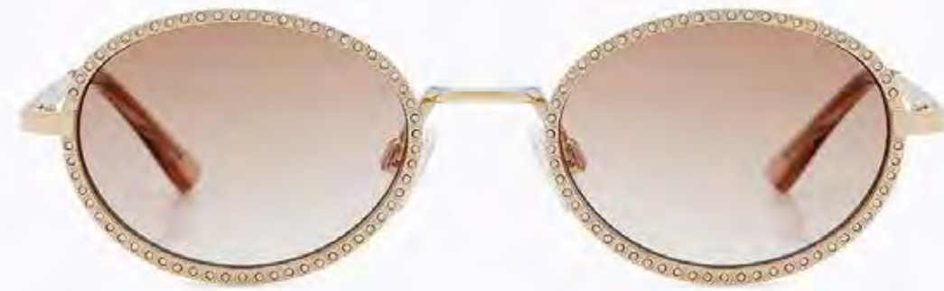
CL3165 SG OPT 01

Frame Color: gold with crystal stones Lens Color: Gradient brown to nude Frame Material: Metal Handle Length: 140 Lens Width: 47 Nose Bridge: 20