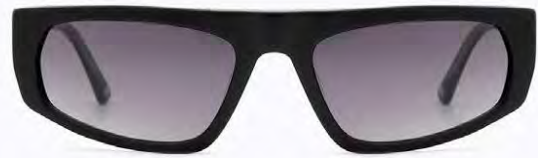
CL9151 SG 01

Frame Color: black Lens Color: Gradient smoke Frame Material: Hand made - Acetate Handle Length: 145 Lens Width: 56 Nose Bridge: 19