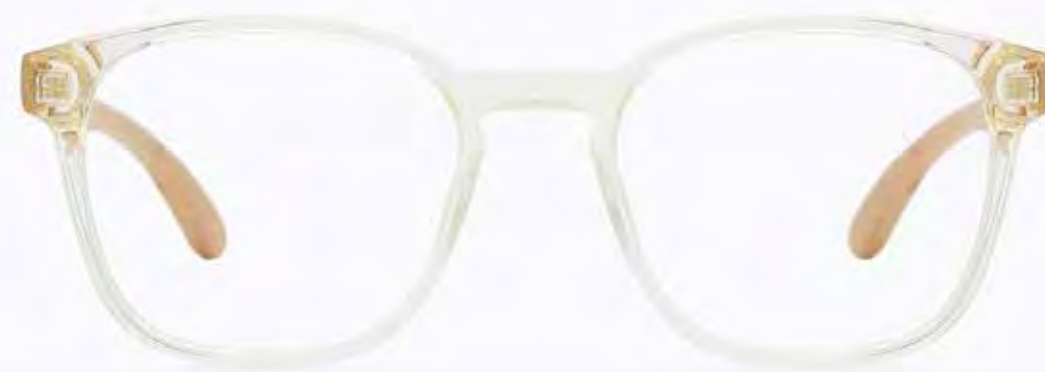
CL4247 OPT 02

Frame Color: Trans light champagne Lens Color: 0 Frame Material: Hand made - Acetate Handle Length: 145 Lens Width: 51 Nose Bridge: 19