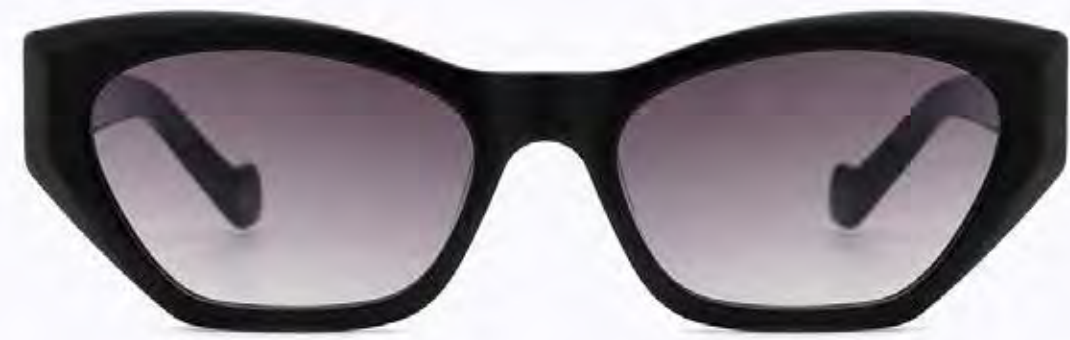
CL9133 SG BIO 01

Frame Color: black Lens Color: Smoke Frame Material: Hand made-Bio acetate Handle Length: 145 Lens Width: 54 Nose Bridge: 18