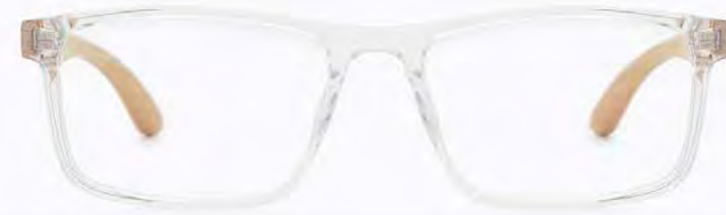
CL4304 OPT 02

Frame Color: Transparent Lens Color: 0 Frame Material: Hand made- Acetate Handle Length: 145 Lens Width: 54 Nose Bridge: 17