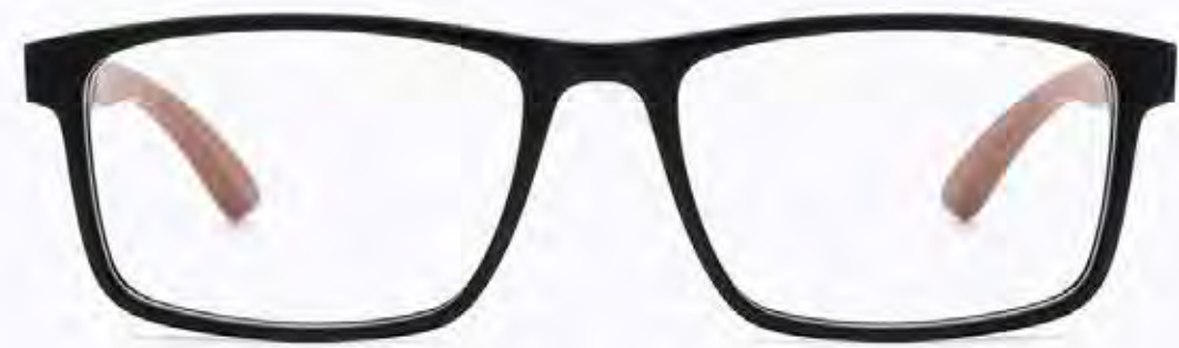
CL4304 OPT 01

Frame Color: Shiny black Lens Color: 0 Frame Material: Hand made- Acetate Handle Length: 145 Lens Width: 54 Nose Bridge: 17