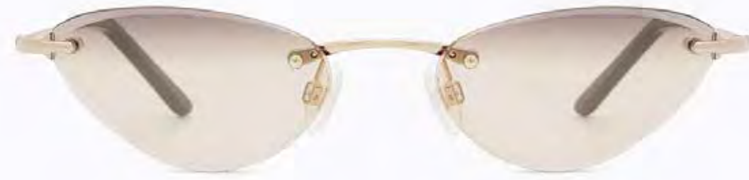
CL3288 SG 01

Frame Color: Gold Lens Color: Gradient smoke to beige Frame Material: Metal Handle Length: 145 Lens Width: 46 Nose Bridge: 22