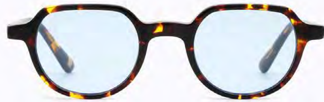
CL9132 SG 03

Frame Color: Demi Lens Color: solid light neon blue Frame Material: Hand made - Acetate Handle Length: 145 Lens Width: 46 Nose Bridge: 22