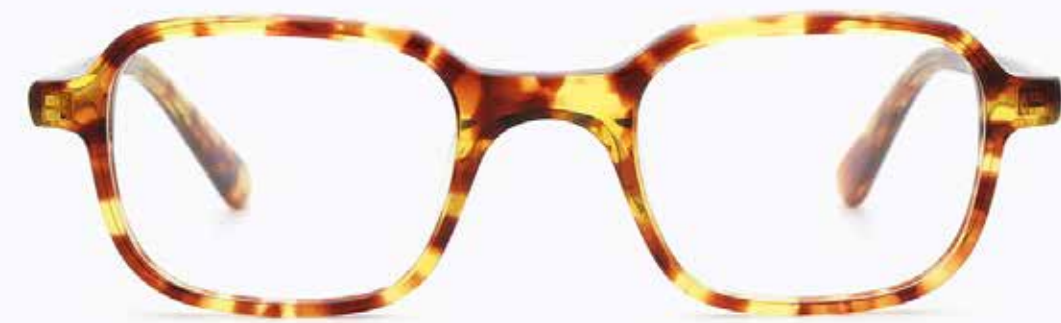
CL4317 OPT 02

Frame Color: Yellow demi Lens Color: 0 Frame Material: Hand made - Acetate Handle Length: 145 Lens Width: 46 Nose Bridge: 22