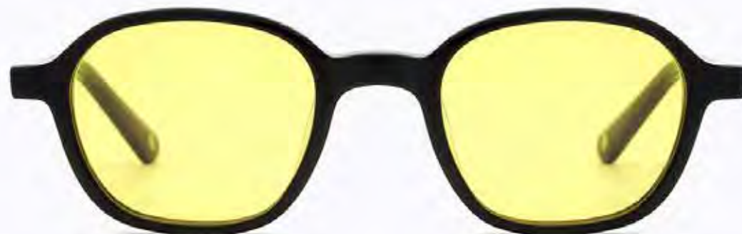
CL9154 SG 03

Frame Color: Shiny Black Lens Color: solid dark yellow Frame Material: Hand made - Acetate Handle Length: 145 Lens Width: 46 Nose Bridge: 22