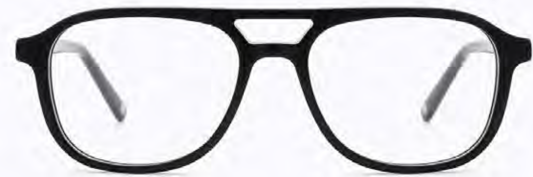
CL4263 OPT 01

Frame Color: Shiny black Lens Color: 0 Frame Material: Hand made- Acetate Handle Length: 145 Lens Width: 52 Nose Bridge: 17