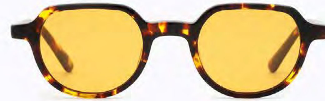
CL9132 SG 02

Frame Color: Demi Lens Color: solid strong orange Frame Material: Hand made - Acetate Handle Length: 145 Lens Width: 46 Nose Bridge: 22