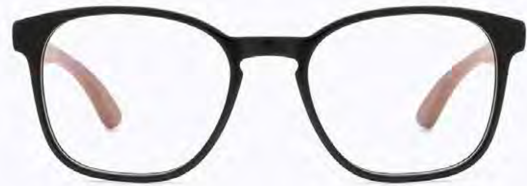
CL4247 OPT 01

Frame Color: Shiny black Lens Color: 0 Frame Material: Hand made - Acetate Handle Length: 145 Lens Width: 51 Nose Bridge: 19