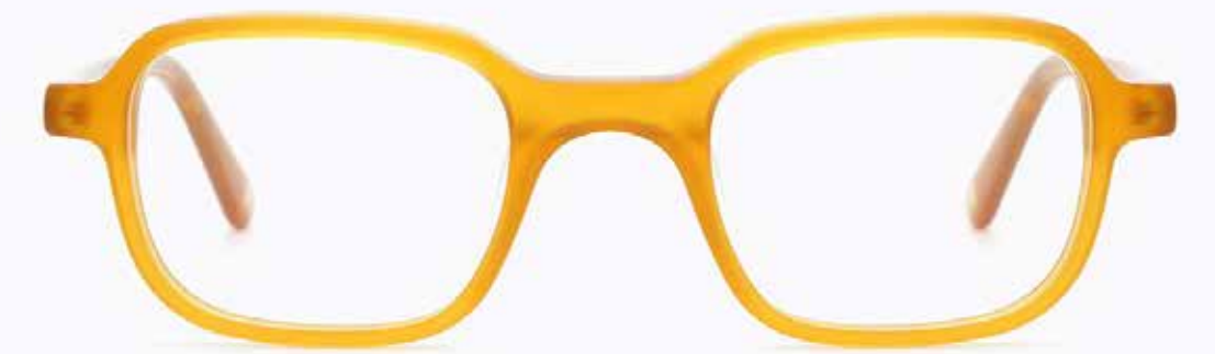
CL4317 OPT 04

Frame Color: Milky musterd Lens Color: 0 Frame Material: Hand made - Acetate Handle Length: 145 Lens Width: 46 Nose Bridge: 22