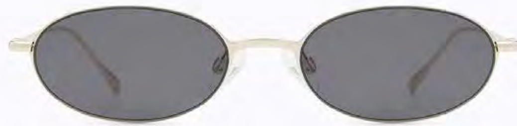
CL3268 SG 02

Frame Color: Shiny light gold Lens Color: Smoke Frame Material: Metal Handle Length: 145 Lens Width: 46 Nose Bridge: 22