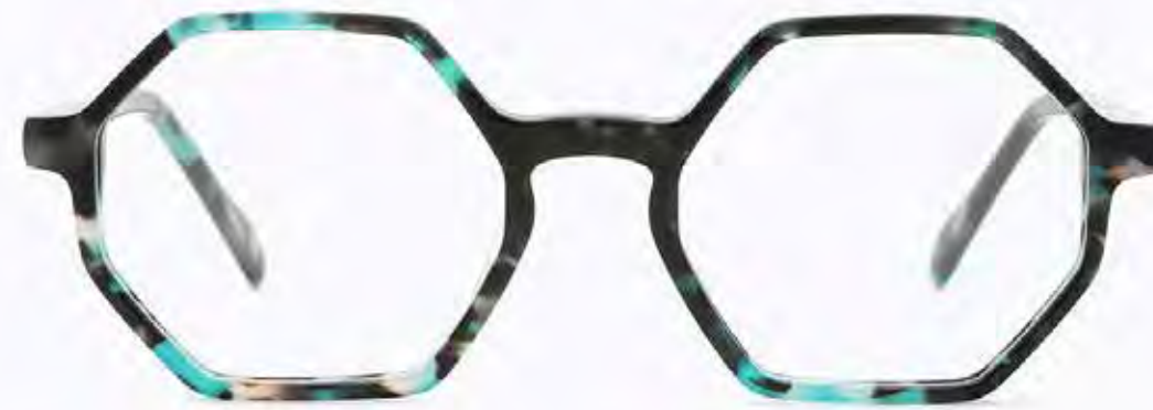
CL4256 OPT 02

Frame Color: Black brown green demi Lens Color: 0 Frame Material: Hand made - Acetate Handle Length: 145 Lens Width: 49 Nose Bridge: 19