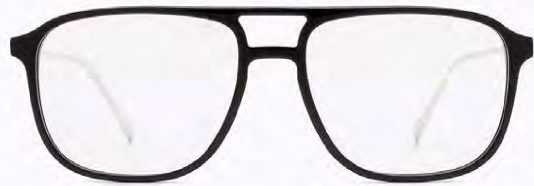
CL4189 OPT 01

Frame Color: Shiny black Lens Color: 0 Frame Material: Hand made - Acetate Handle Length: 145 Lens Width: 54 Nose Bridge: 16