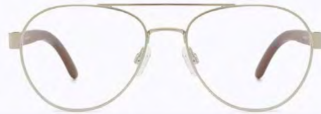
CL4310 OPT 02

Frame Color: silver Lens Color: 0 Frame Material: Metal Handle Length: 140 Lens Width: 54 Nose Bridge: 17