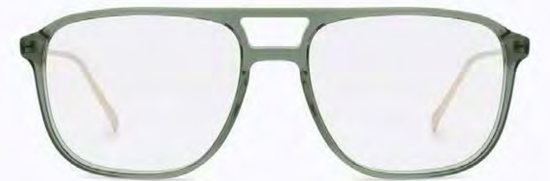
CL4189 OPT 04

Frame Color: Trans olive Lens Color: 0 Frame Material: Hand made - Acetate Handle Length: 145 Lens Width: 54 Nose Bridge: 16