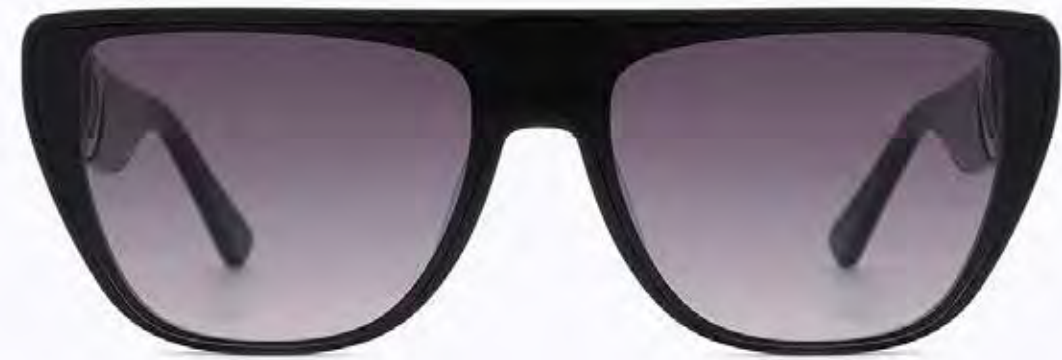
CL9176 SG 01

Frame Color: Shiny Black Lens Color: gradient smoke Frame Material: Hand made - Acetate Handle Length: 145 Lens Width: 137 Nose Bridge: 0