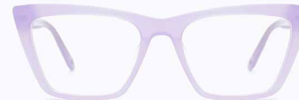
CL4204 OPT 05

Frame Color: Milky purple Lens Color: 0 Frame Material: Hand made - Acetate Handle Length: 145 Lens Width: 52 Nose Bridge: 17