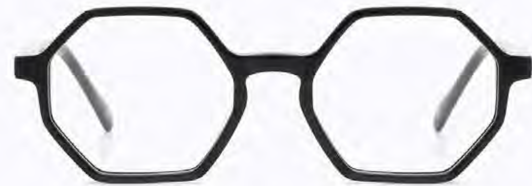
CL4256 OPT 01

Frame Color: Shiny black Lens Color: 0 Frame Material: Hand made - Acetate Handle Length: 145 Lens Width: 49 Nose Bridge: 19