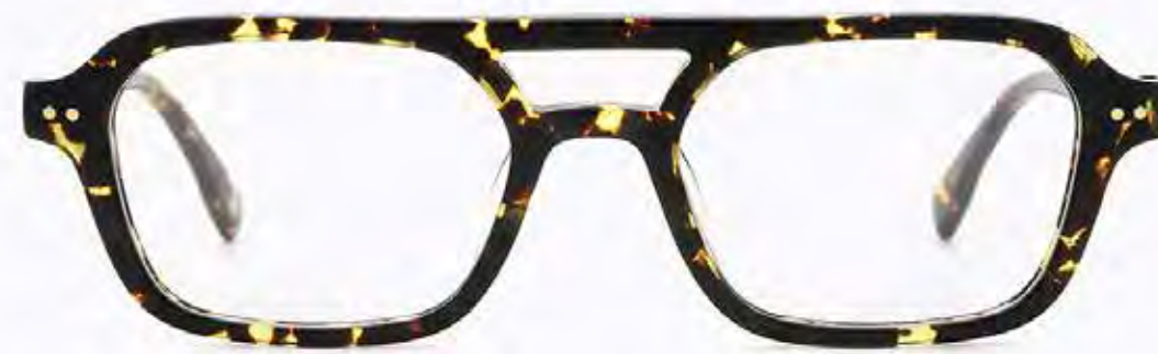
CL4316 OPT 02

Frame Color: Demi 1YWP4B002 Lens Color: 0 Frame Material: Hand made - Acetate Handle Length: 145 Lens Width: 51 Nose Bridge: 19