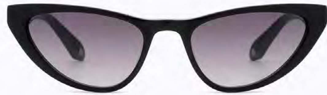
CL9170 SG 01

Frame Color: Black Lens Color: Gradient smoke Frame Material: Hand made- Acetate Handle Length: 145 Lens Width: 55 Nose Bridge: 20