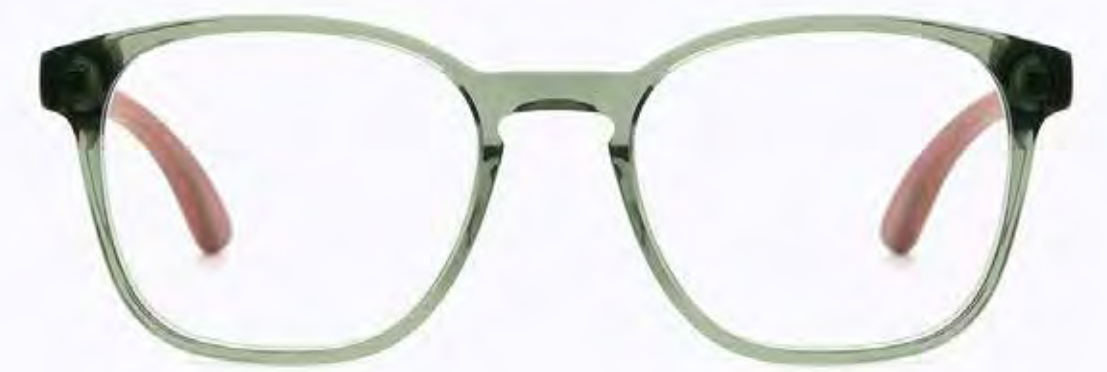
CL4247 OPT 03

Frame Color: Trans olive Lens Color: 0 Frame Material: Hand made - Acetate Handle Length: 145 Lens Width: 51 Nose Bridge: 19