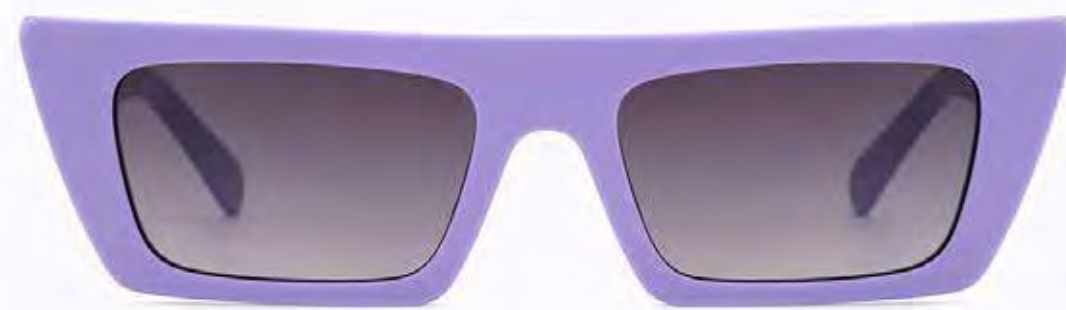
CL9150 SG BIO 02

Frame Color: Solid lilach Lens Color: Gradient smoke Frame Material: Hand made-Bio acetate Handle Length: 145 Lens Width: 54 Nose Bridge: 19