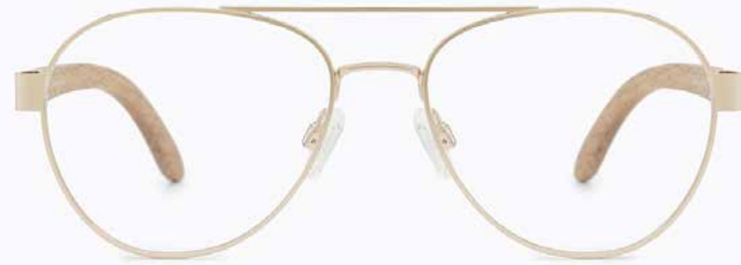
CL4310 OPT 01

Frame Color: shiny light gold Lens Color: 0 Frame Material: Metal Handle Length: 140 Lens Width: 54 Nose Bridge: 17