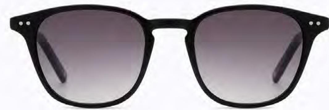
CL9207 SG 01

Frame Color: black Lens Color: Gradient smoke Frame Material: Hand made - Acetate Handle Length: 140 Lens Width: 48 Nose Bridge: 20