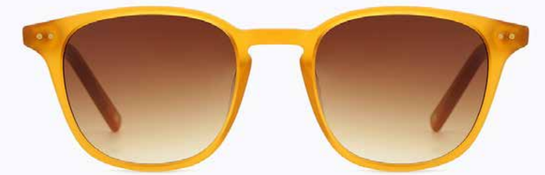
CL9207 SG 04

Frame Color: Brown mustard Lens Color: Gradient brown Frame Material: Hand made - Acetate Handle Length: 140 Lens Width: 48 Nose Bridge: 20