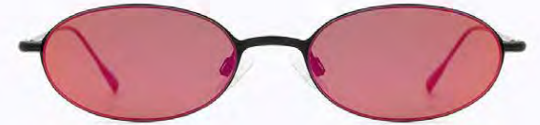
CL3268 SG 03

Frame Color: Matt black Lens Color: brown red revo Frame Material: Metal Handle Length: 145 Lens Width: 46 Nose Bridge: 22