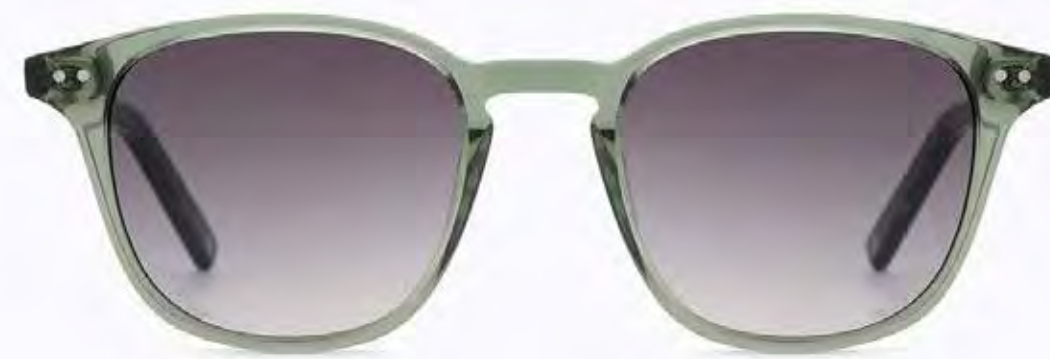
CL9207 SG 02

Frame Color: Trans olive Lens Color: Gradient smoke Frame Material: Hand made - Acetate Handle Length: 140 Lens Width: 48 Nose Bridge: 20