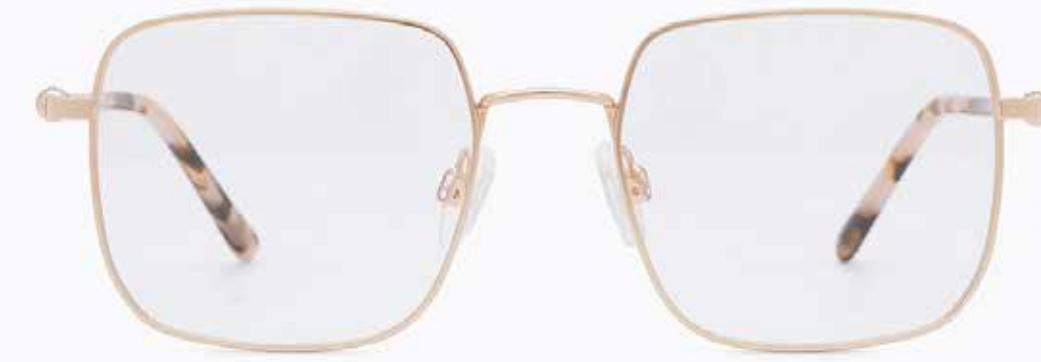
CL4258 OPT 02

Frame Color: Rose gold Lens Color: 0 Frame Material: Metal Handle Length: 145 Lens Width: 51 Nose Bridge: 19