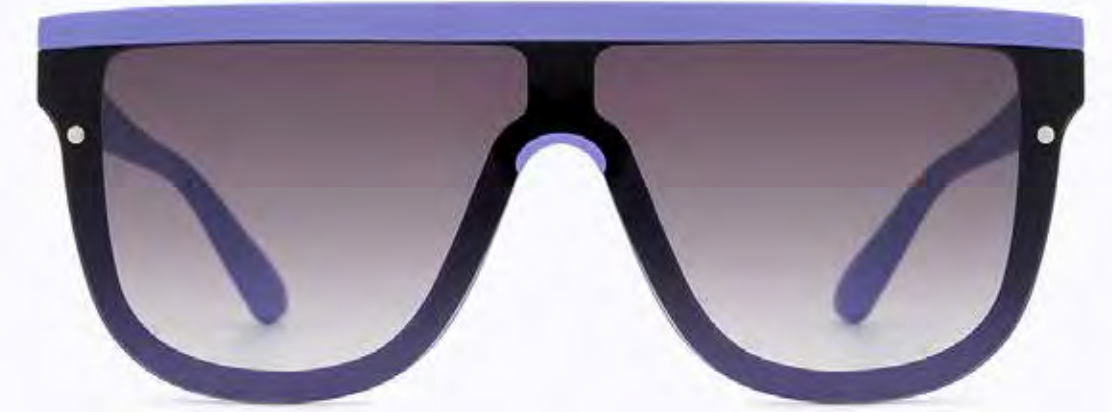
CL3258 SG 03

Frame Color: Matt purple Lens Color: Gradient smoke Frame Material: T.R. 90 Handle Length: 145 Lens Width: 146 Nose Bridge: 0