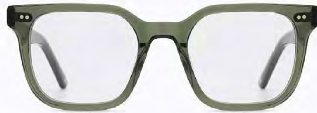
CL4250 OPT 03

Frame Color: Trans olive Lens Color: 0 Frame Material: Hand made - Acetate Handle Length: 145 Lens Width: 49 Nose Bridge: 21