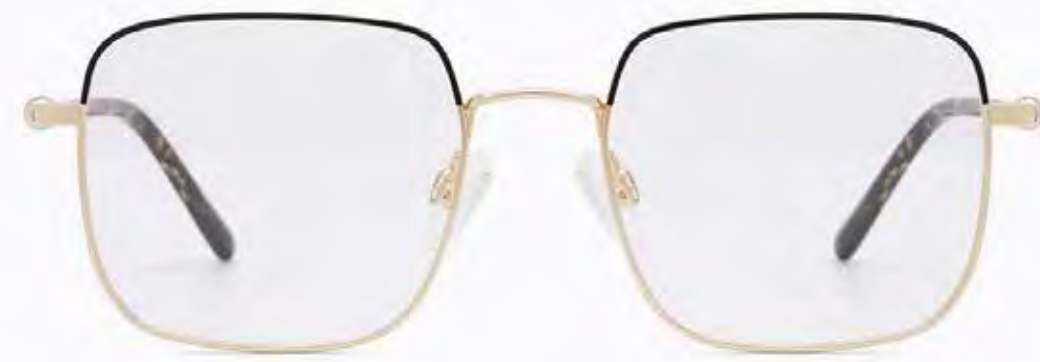
CL4258 OPT 01

Frame Color: Black-gold Lens Color: 0 Frame Material: Metal Handle Length: 145 Lens Width: 51 Nose Bridge: 19