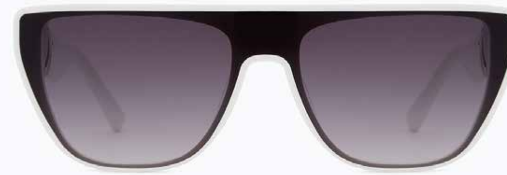
CL9176 SG 02

Frame Color: white Lens Color: gradient smoke Frame Material: Hand made - Acetate Handle Length: 145 Lens Width: 137 Nose Bridge: 0