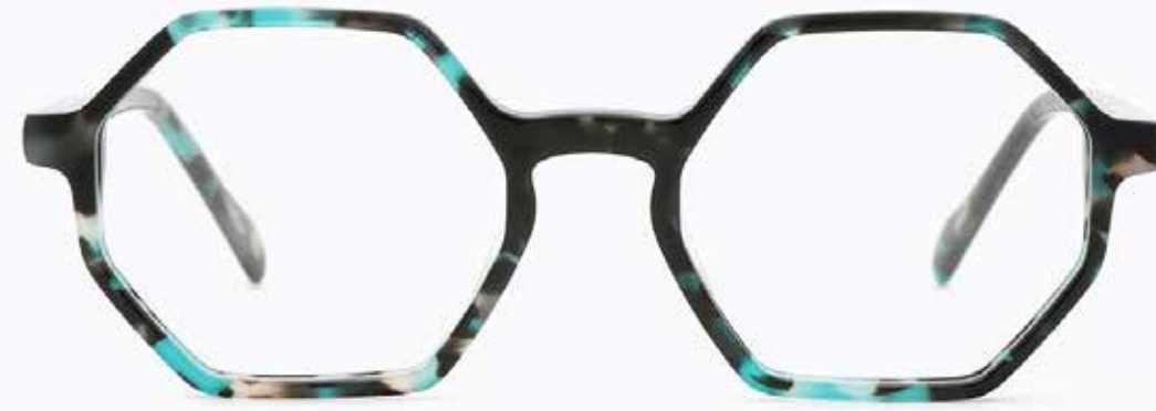
CL4256 OPT 02

Frame Color: Black brown green demi Lens Color: 0 Frame Material: Hand made - Acetate Handle Length: 145 Lens Width: 49 Nose Bridge: 19