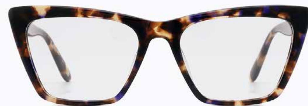
CL4204 OPT 02

Frame Color: Brown beige blue demi Lens Color: 0 Frame Material: Hand made - Acetate Handle Length: 145 Lens Width: 52 Nose Bridge: 17