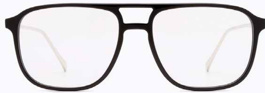
CL4189 OPT 01

Frame Color: Shiny black Lens Color: 0 Frame Material: Hand made - Acetate Handle Length: 145 Lens Width: 54 Nose Bridge: 16