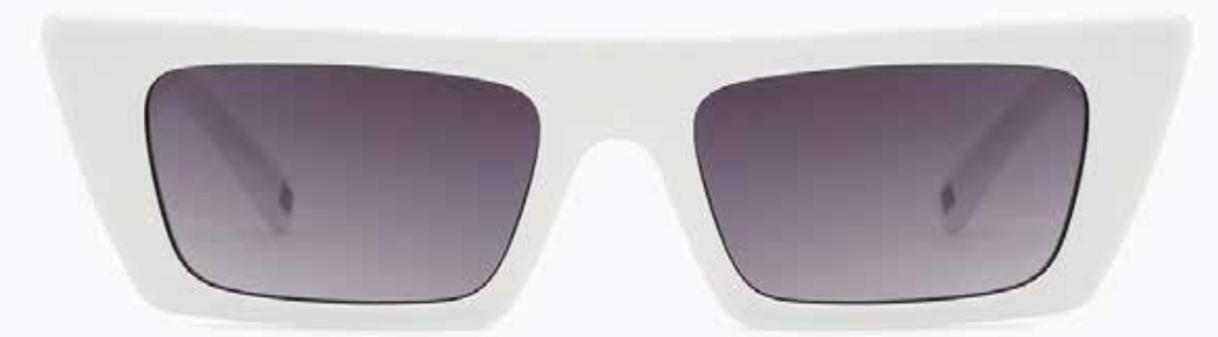
CL9150 SG BIO 03

Frame Color: White Lens Color: Gradient smoke Frame Material: Hand made-Bio acetate Handle Length: 145 Lens Width: 54 Nose Bridge: 19