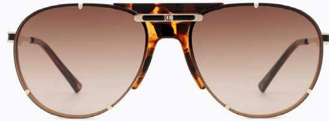
CL3278 SG 01

Frame Color: shiny light gold/shiny demi Lens Color: Gradient dark brown/light brown Frame Material: Metal Handle Length: 145 Lens Width: 60 Nose Bridge: 17