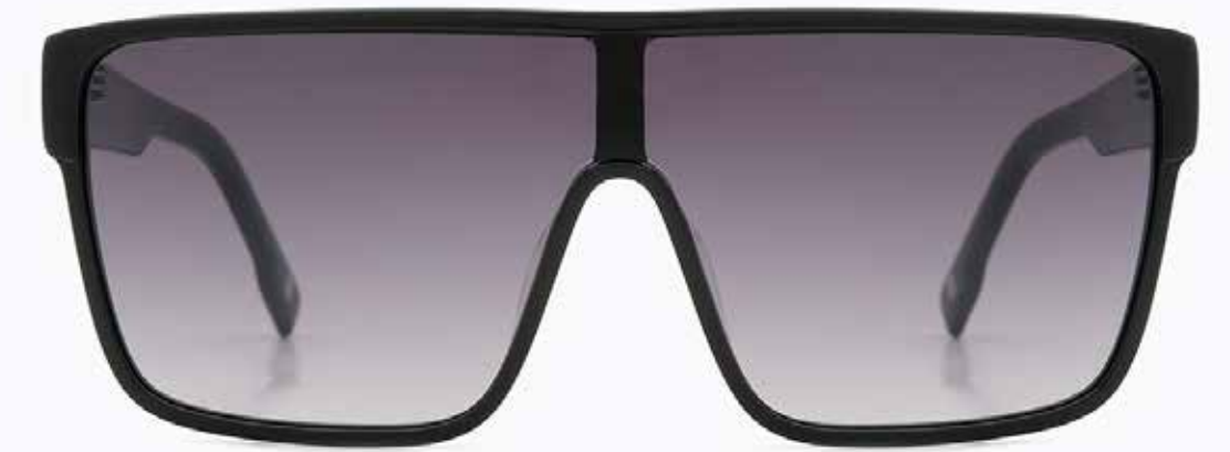
CL9134 SG 01

Frame Color: Shiny Black Lens Color: Gradient smoke Frame Material: Hand made - Acetate Handle Length: 145 Lens Width: 137 Nose Bridge: 0