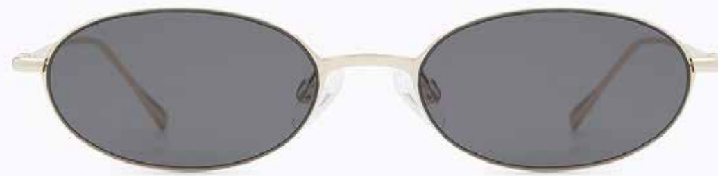
CL3268 SG 02

Frame Color: Shiny light gold Lens Color: Smoke Frame Material: Metal Handle Length: 145 Lens Width: 46 Nose Bridge: 22