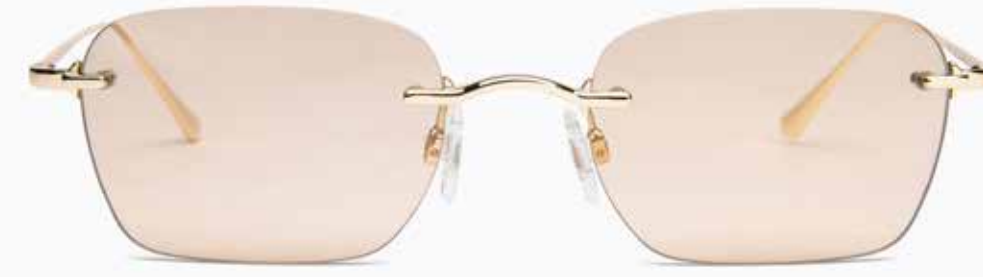
CL6800 SG 07

Frame Color: Gold Lens Color: Light brown with gold mirror Frame Material: Metal Handle Length: 145 Lens Width: 46 Nose Bridge: 22