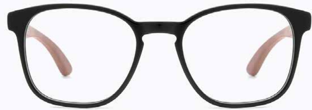
CL4247 OPT 01

Frame Color: Shiny black Lens Color: 0 Frame Material: Hand made - Acetate Handle Length: 145 Lens Width: 51 Nose Bridge: 19