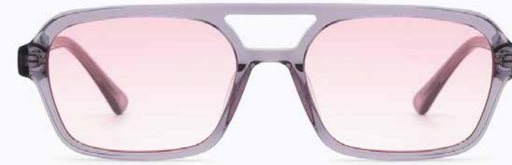
CL9138 SG 05

Frame Color: Transparent dark grey Lens Color: Gradient pink to trans Frame Material: Hand made - Acetate Handle Length: 145 Lens Width: 55 Nose Bridge: 18