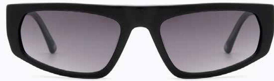
CL9151 SG 01

Frame Color: black Lens Color: Gradient smoke Frame Material: Hand made - Acetate Handle Length: 145 Lens Width: 56 Nose Bridge: 19