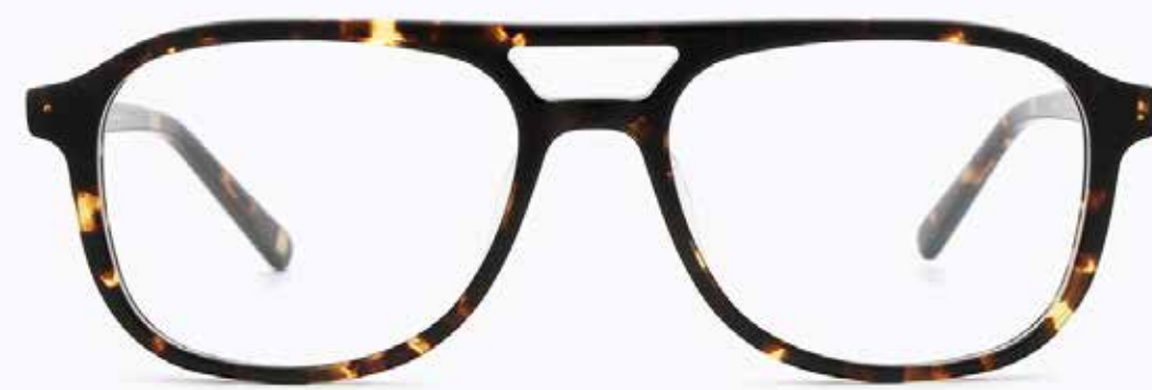
CL4263 OPT 02

Frame Color: Black light yellow demi Lens Color: 0 Frame Material: Hand made- Acetate Handle Length: 145 Lens Width: 52 Nose Bridge: 17