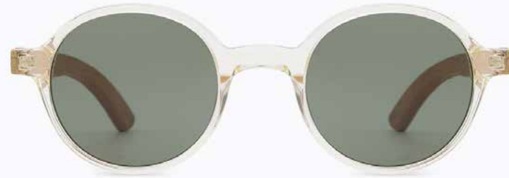
CL9167 SG WT 02

Frame Color: Shiny trasn l.champagne Lens Color: G15 Frame Material: Hand made - Acetate Handle Length: 145 Lens Width: 46 Nose Bridge: 22