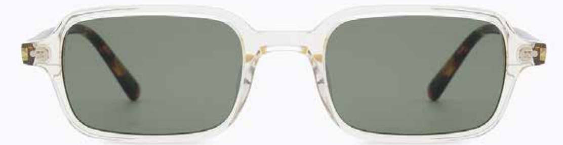
CL9185 SG 03

Frame Color: Trans light champagne Lens Color: G15 Frame Material: Hand made - Acetate Handle Length: 145 Lens Width: 49 Nose Bridge: 20