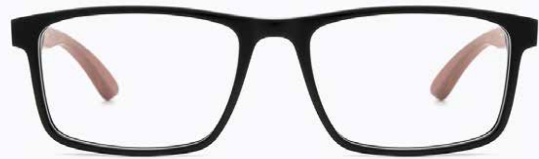
CL4304 OPT 01

Frame Color: Shiny black Lens Color: 0 Frame Material: Hand made- Acetate Handle Length: 145 Lens Width: 54 Nose Bridge: 17