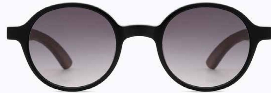
CL9167 SG WT 01

Frame Color: Shiny black Lens Color: Gradient smoke Frame Material: Hand made - Acetate Handle Length: 145 Lens Width: 46 Nose Bridge: 22