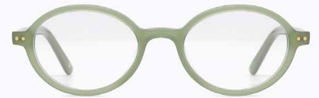
CL4207 OPT 03

Frame Color: Milky olive green Lens Color: 0 Frame Material: Hand made - Acetate Handle Length: 145 Lens Width: 49 Nose Bridge: 19