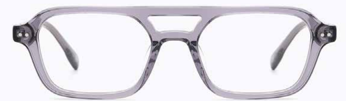
CL4316 OPT 03

Frame Color: Transparent dark grey Lens Color: 0 Frame Material: Hand made - Acetate Handle Length: 145 Lens Width: 51 Nose Bridge: 19