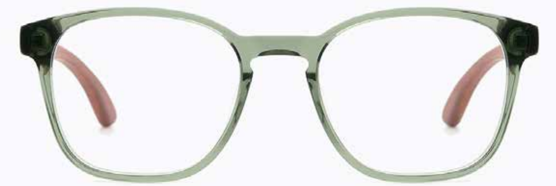
CL4247 OPT 03

Frame Color: Trans olive Lens Color: 0 Frame Material: Hand made - Acetate Handle Length: 145 Lens Width: 51 Nose Bridge: 19