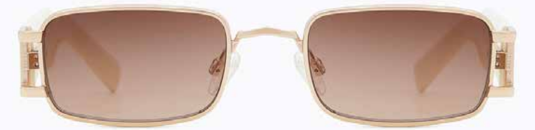
CL3220 SG 03

Frame Color: Shiny light gold Lens Color: Gradient brown Frame Material: Metal Handle Length: 145 Lens Width: 49 Nose Bridge: 20