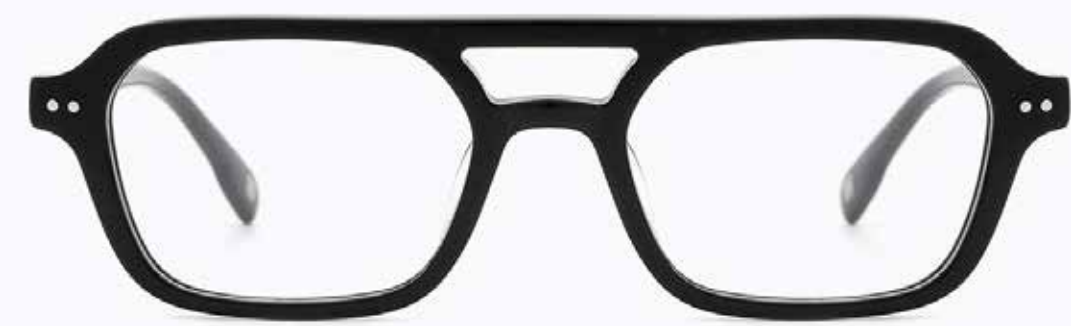
CL4316 OPT 01

Frame Color: Black Lens Color: 0 Frame Material: Hand made - Acetate Handle Length: 145 Lens Width: 51 Nose Bridge: 19