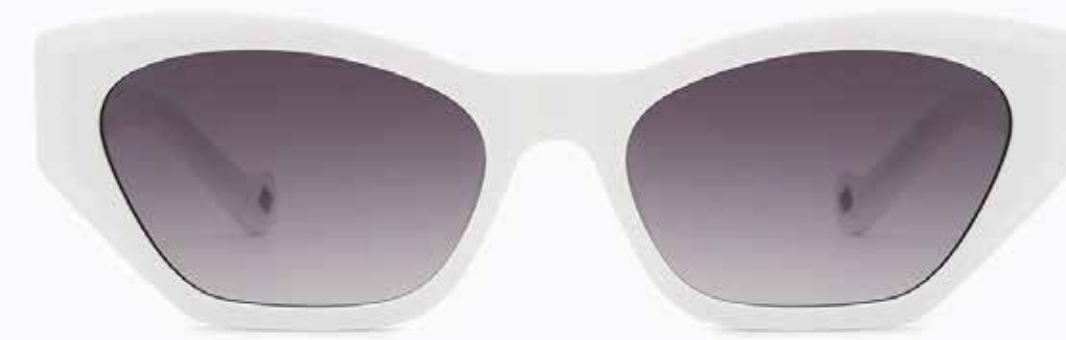
CL9133 SG BIO 02

Frame Color: white Lens Color: Smoke Frame Material: Hand made- Acetate Handle Length: 145 Lens Width: 54 Nose Bridge: 18