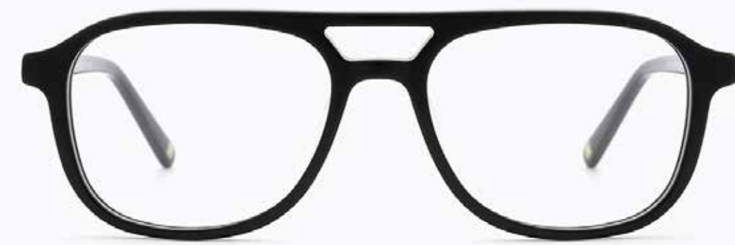
CL4263 OPT 01

Frame Color: Shiny black Lens Color: 0 Frame Material: Hand made- Acetate Handle Length: 145 Lens Width: 52 Nose Bridge: 17