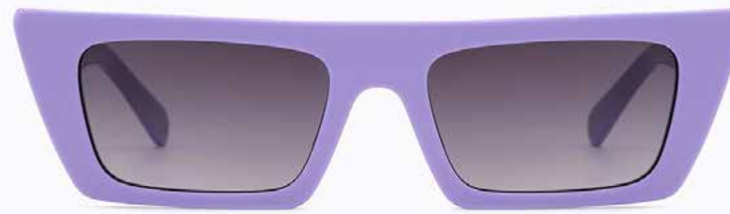
CL9150 SG BIO 02

Frame Color: Solid lilach Lens Color: Gradient smoke Frame Material: Hand made-Bio acetate Handle Length: 145 Lens Width: 54 Nose Bridge: 19