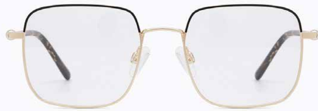
CL4258 OPT 01

Frame Color: Black-gold Lens Color: 0 Frame Material: Metal Handle Length: 145 Lens Width: 51 Nose Bridge: 19