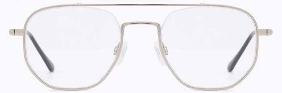
CL4267 OPT 03

Frame Color: Transparent dark grey Lens Color: 0 Frame Material: Metal Handle Length: 145 Lens Width: 49 Nose Bridge: 20