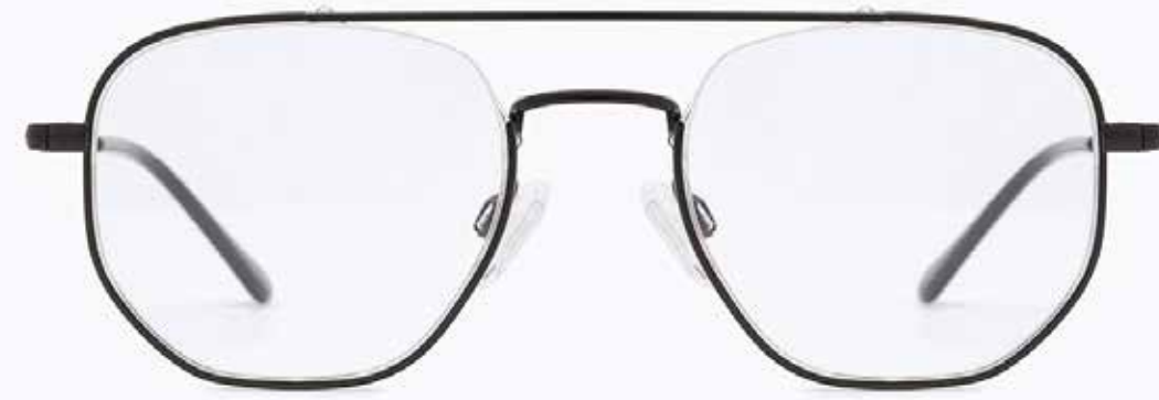
CL4267 OPT 01

Frame Color: Black Lens Color: 0 Frame Material: Metal Handle Length: 145 Lens Width: 49 Nose Bridge: 20