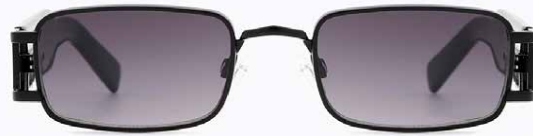
CL3220 SG 02

Frame Color: Shiny Black Lens Color: Gradient smoke Frame Material: Metal Handle Length: 145 Lens Width: 49 Nose Bridge: 20