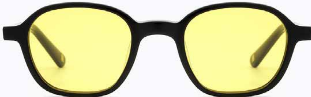
CL9154 SG 03

Frame Color: Shiny Black Lens Color: solid dark yellow Frame Material: Hand made - Acetate Handle Length: 145 Lens Width: 46 Nose Bridge: 22