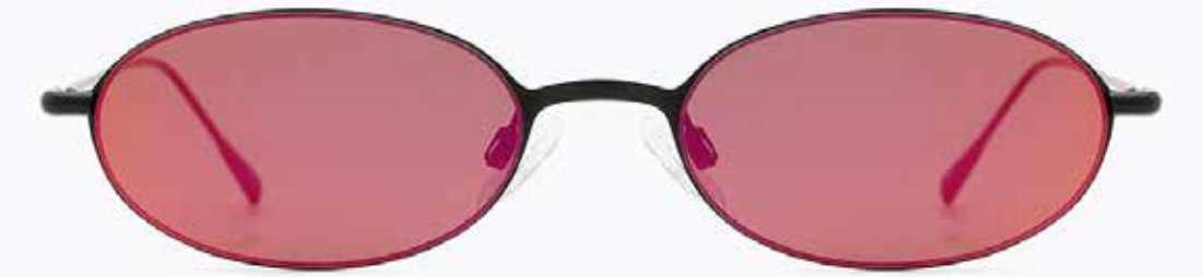
CL3268 SG 03

Frame Color: Matt black Lens Color: brown red revo Frame Material: Metal Handle Length: 145 Lens Width: 46 Nose Bridge: 22