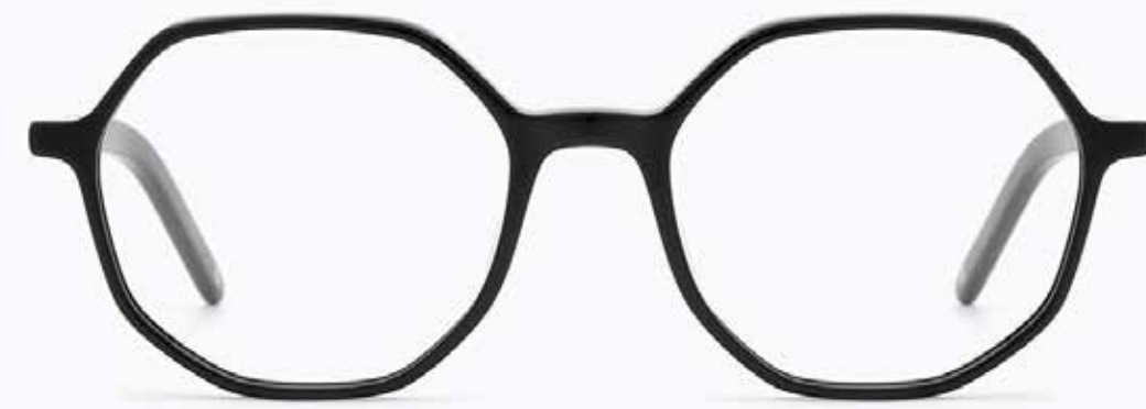
CL4255 OPT 01

Frame Color: Shiny black Lens Color: 0 Frame Material: Hand made - Acetate Handle Length: 140 Lens Width: 51 Nose Bridge: 18