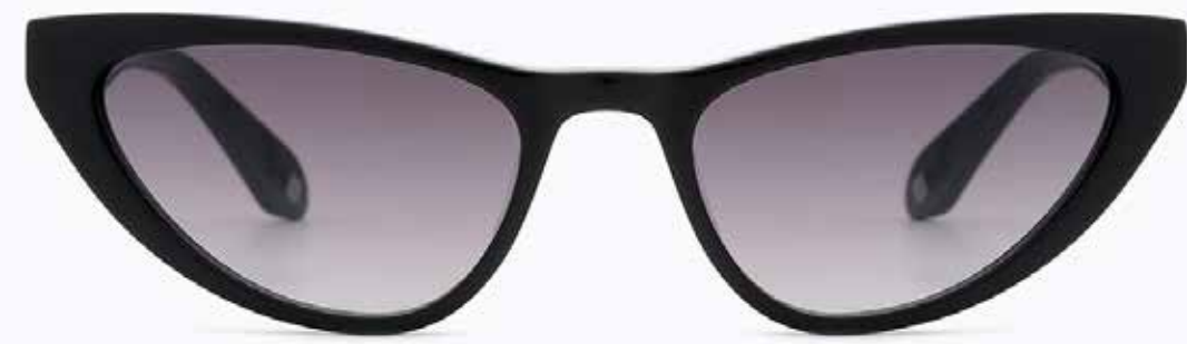
CL9170 SG 01

Frame Color: Black Lens Color: Gradient smoke Frame Material: Hand made- Acetate Handle Length: 145 Lens Width: 55 Nose Bridge: 20