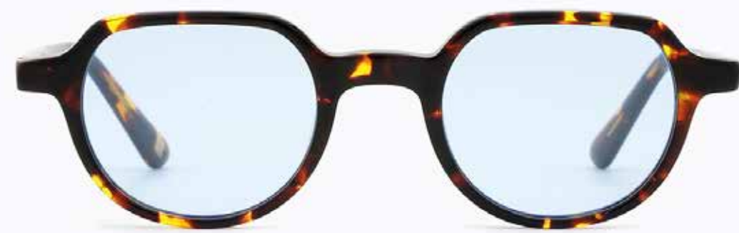
CL9132 SG 03

Frame Color: Demi Lens Color: solid light neon blue Frame Material: Hand made - Acetate Handle Length: 145 Lens Width: 46 Nose Bridge: 22