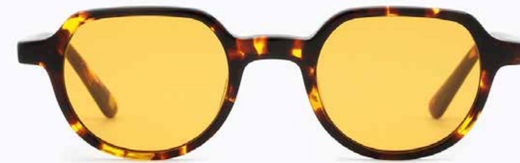
CL9132 SG 02

Frame Color: Demi Lens Color: solid strong orange Frame Material: Hand made - Acetate Handle Length: 145 Lens Width: 46 Nose Bridge: 22