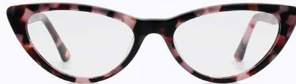
CL4213 OPT 02

Frame Color: Red purple pink demi Lens Color: 0 Frame Material: Hand made - Acetate Handle Length: 145 Lens Width: 53 Nose Bridge: 17