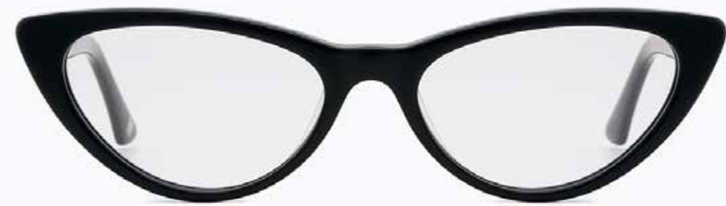
CL4213 OPT 01

Frame Color: Black Lens Color: 0 Frame Material: Hand made - Acetate Handle Length: 145 Lens Width: 53 Nose Bridge: 17