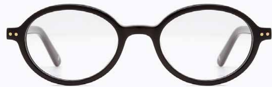
CL4207 OPT 01

Frame Color: Shiny black Lens Color: 0 Frame Material: Hand made - Acetate Handle Length: 145 Lens Width: 49 Nose Bridge: 19