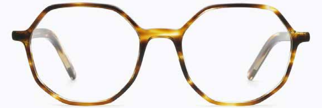
CL4255 OPT 03

Frame Color: Brown stripes demi Lens Color: 0 Frame Material: Hand made - Acetate Handle Length: 140 Lens Width: 51 Nose Bridge: 18