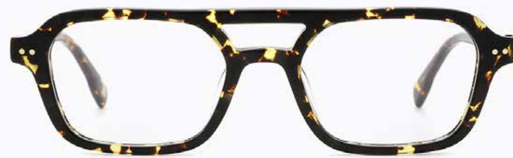
CL4316 OPT 02

Frame Color: Demi 1YWP4B002 Lens Color: 0 Frame Material: Hand made - Acetate Handle Length: 145 Lens Width: 51 Nose Bridge: 19