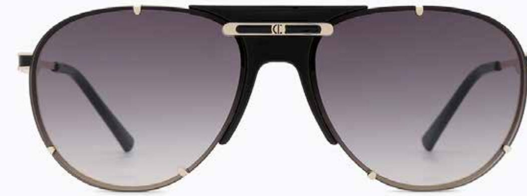
CL3278 SG 02

Frame Color: shiny light gold/shiny black Lens Color: Gradient smoke Frame Material: Metal Handle Length: 145 Lens Width: 60 Nose Bridge: 17