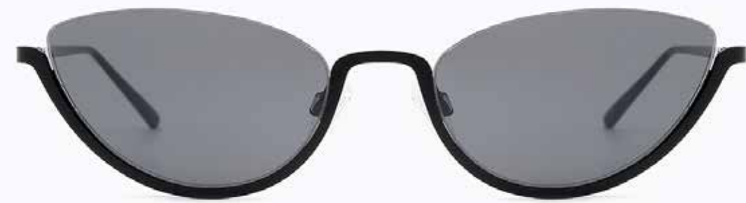
CL3287 SG 01

Frame Color: Shiny Black Lens Color: Smoke Frame Material: Metal Handle Length: 135 Lens Width: 57 Nose Bridge: 20