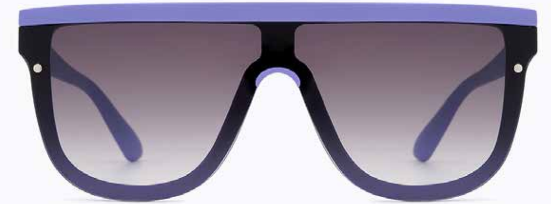
CL3258 SG 03

Frame Color: Matt purple Lens Color: Gradient smoke Frame Material: T.R. 90 Handle Length: 145 Lens Width: 146 Nose Bridge: 0