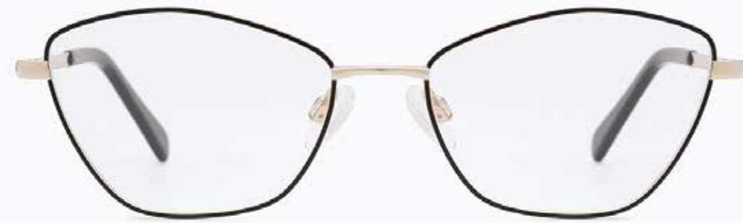
CL4281 OPT 01

Frame Color: Shiny light gold/shiny black Lens Color: 0 Frame Material: Metal Handle Length: 145 Lens Width: 53 Nose Bridge: 17