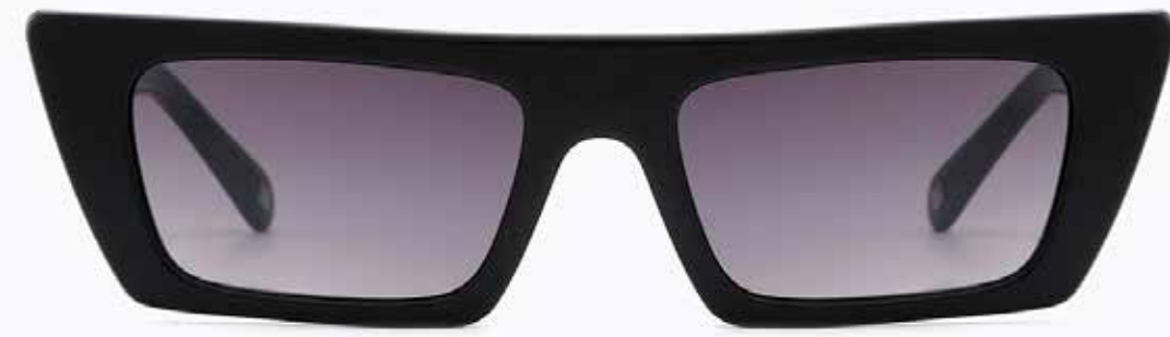
CL9150 SG BIO 01

Frame Color: Black Lens Color: Gradient smoke Frame Material: Hand made-Bio acetate Handle Length: 145 Lens Width: 54 Nose Bridge: 19