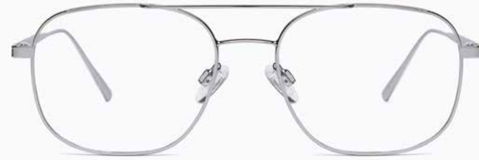
CL4164 OPT 02

Frame Color: Yellow orange demi Lens Color: 0 Frame Material: Metal Handle Length: 145 Lens Width: 53 Nose Bridge: 17