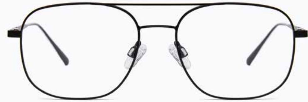
CL4164 OPT 01

Frame Color: Shiny black Lens Color: 0 Frame Material: Metal Handle Length: 145 Lens Width: 53 Nose Bridge: 17