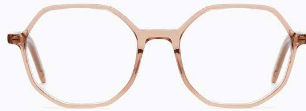
CL4255 OPT 02

Frame Color: Light trans brown Lens Color: 0 Frame Material: Hand made - Acetate Handle Length: 140 Lens Width: 51 Nose Bridge: 18