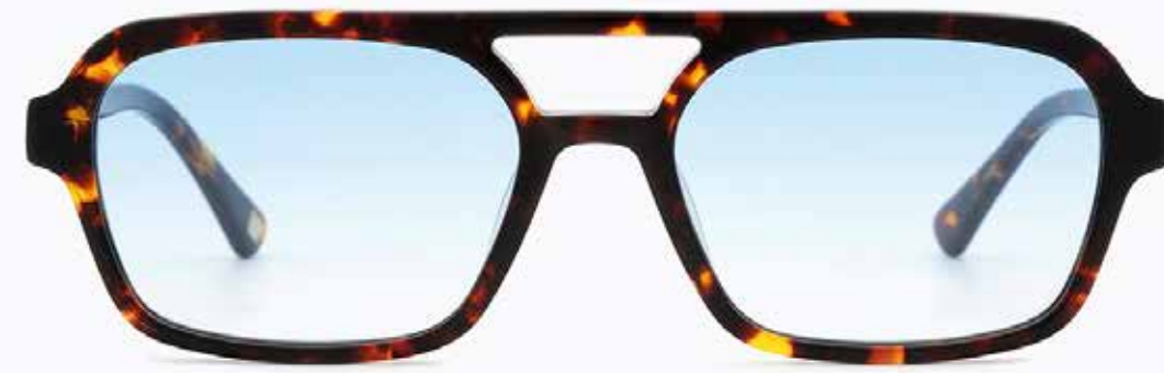
CL9138 SG 02

Frame Color: Demi Lens Color: Gradient blue to transparent Frame Material: Hand made- Acetate Handle Length: 145 Lens Width: 55 Nose Bridge: 18