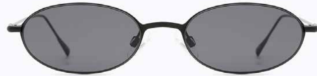
CL3268 SG 01

Frame Color: Matt black Lens Color: Smoke Frame Material: Metal Handle Length: 145 Lens Width: 46 Nose Bridge: 22