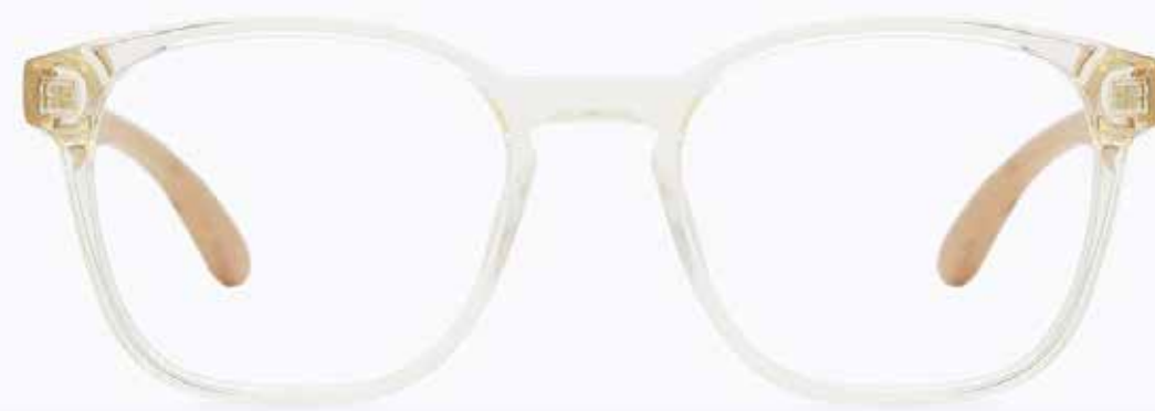
CL4247 OPT 02

Frame Color: Trans light champagne Lens Color: 0 Frame Material: Hand made - Acetate Handle Length: 145 Lens Width: 51 Nose Bridge: 19