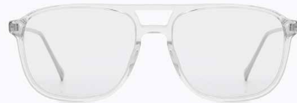
CL4189 OPT 03

Frame Color: Transparent Lens Color: 0 Frame Material: Hand made - Acetate Handle Length: 145 Lens Width: 54 Nose Bridge: 16