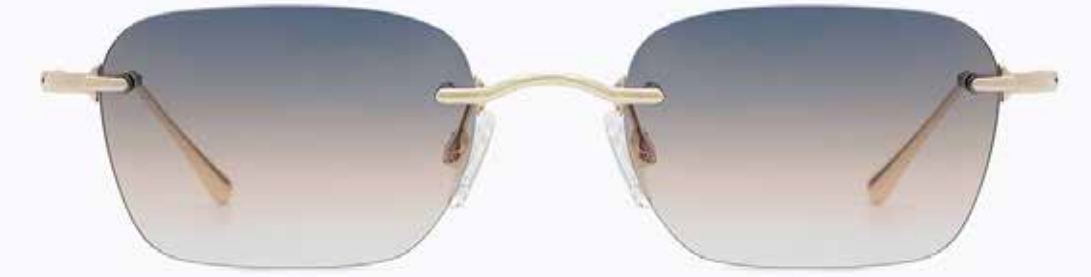
CL6800 SG 11

Frame Color: Gold Lens Color: gradient smoke Frame Material: Metal Handle Length: 145 Lens Width: 46 Nose Bridge: 22