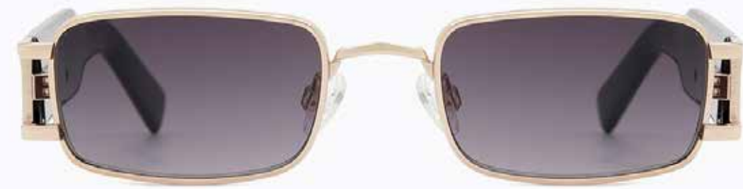
CL3220 SG 01

Frame Color: Shiny light gold Lens Color: Gradient smoke Frame Material: Metal Handle Length: 145 Lens Width: 49 Nose Bridge: 20