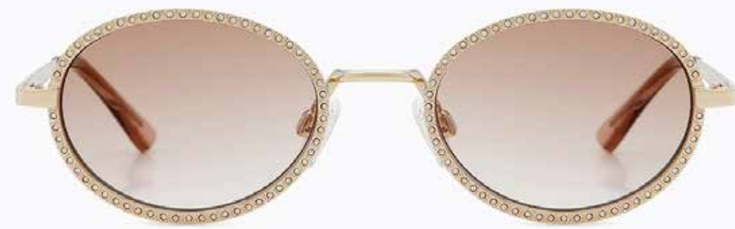
CL3165 SG OPT 01

Frame Color: gold with crystal stones Lens Color: Gradient brown to nude Frame Material: Metal Handle Length: 140 Lens Width: 47 Nose Bridge: 20