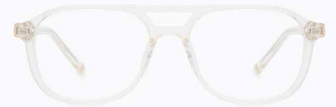
CL4263 OPT 03

Frame Color: Trans light champagne Lens Color: 0 Frame Material: Hand made- Acetate Handle Length: 145 Lens Width: 52 Nose Bridge: 17