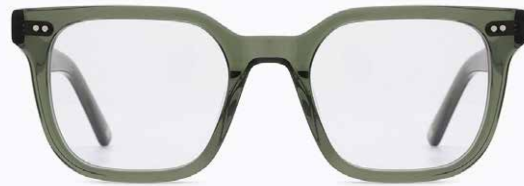
CL4250 OPT 03

Frame Color: Trans olive Lens Color: 0 Frame Material: Hand made - Acetate Handle Length: 145 Lens Width: 49 Nose Bridge: 21