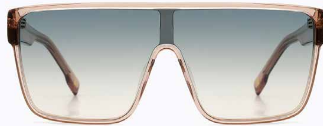
CL9134 SG 02

Frame Color: Dark trans champagne Lens Color: Gradient green to yellow Frame Material: Hand made - Acetate Handle Length: 145 Lens Width: 137 Nose Bridge: 0