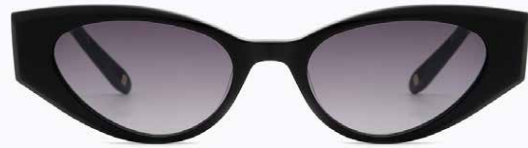
CL9180 SG BIO 01

Frame Color: black Lens Color: Gradient smoke Frame Material: Hand made-Bio acetate Handle Length: 145 Lens Width: 51 Nose Bridge: 19