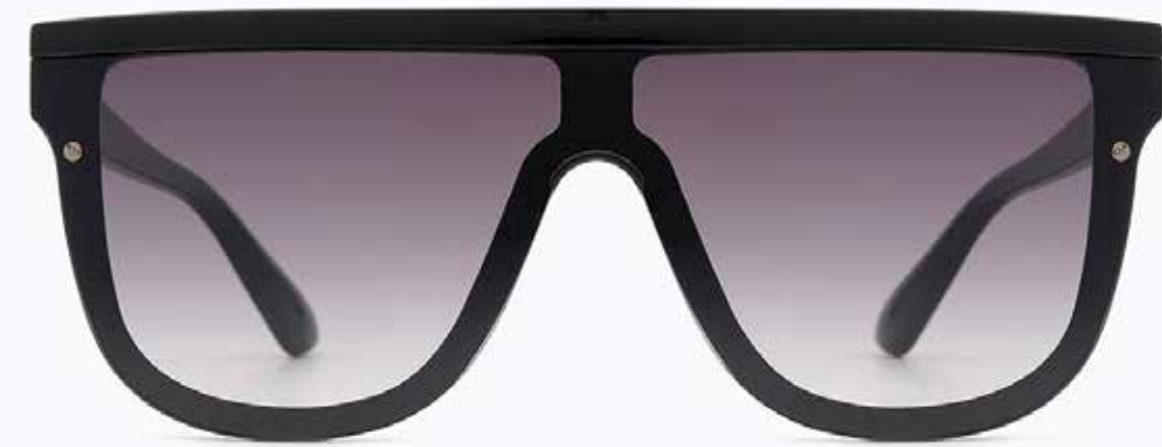
CL3258 SG 01

Frame Color: Shiny Black Lens Color: Gradient smoke Frame Material: T.R. 90 Handle Length: 145 Lens Width: 146 Nose Bridge: 0