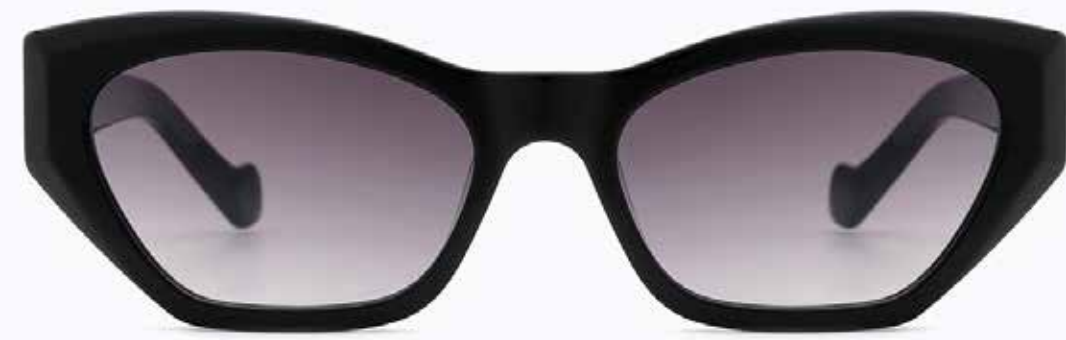
CL9133 SG BIO 01

Frame Color: black Lens Color: Smoke Frame Material: Hand made-Bio acetate Handle Length: 145 Lens Width: 54 Nose Bridge: 18