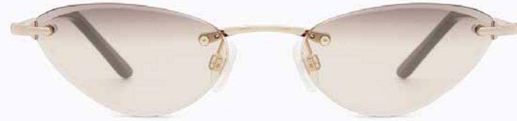
CL3288 SG 01

Frame Color: Gold Lens Color: Gradient smoke to beige Frame Material: Metal Handle Length: 145 Lens Width: 46 Nose Bridge: 22