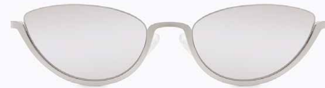
CL3287 SG 02

Frame Color: Shiny Black Lens Color: Silver mirror-smoke Frame Material: Metal Handle Length: 135 Lens Width: 57 Nose Bridge: 20