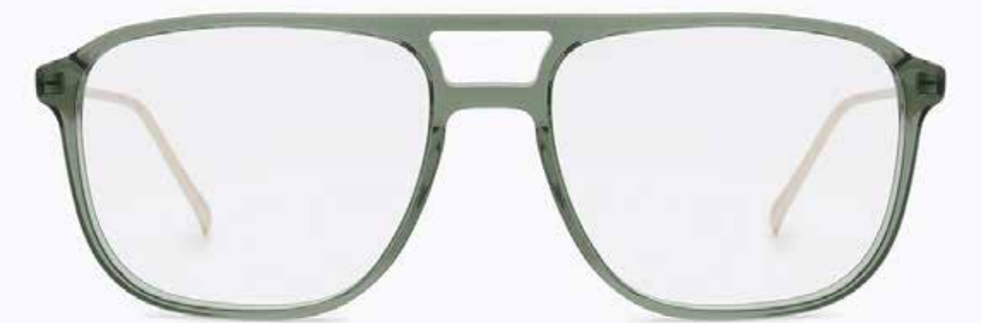
CL4189 OPT 04

Frame Color: Trans olive Lens Color: 0 Frame Material: Hand made - Acetate Handle Length: 145 Lens Width: 54 Nose Bridge: 16