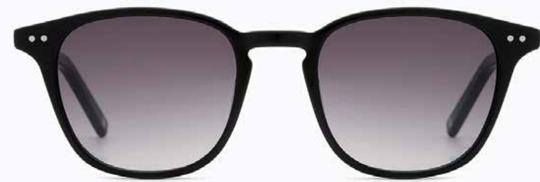
CL9207 SG 01

Frame Color: black Lens Color: Gradient smoke Frame Material: Hand made - Acetate Handle Length: 140 Lens Width: 48 Nose Bridge: 20