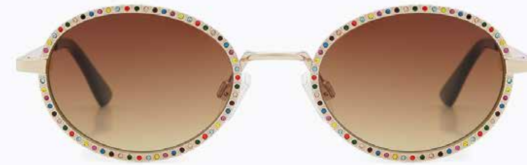
CL3165 SG OPT 02

Frame Color: shiny gold with colorful stones Lens Color: Gradient brown Frame Material: Metal Handle Length: 140 Lens Width: 47 Nose Bridge: 20