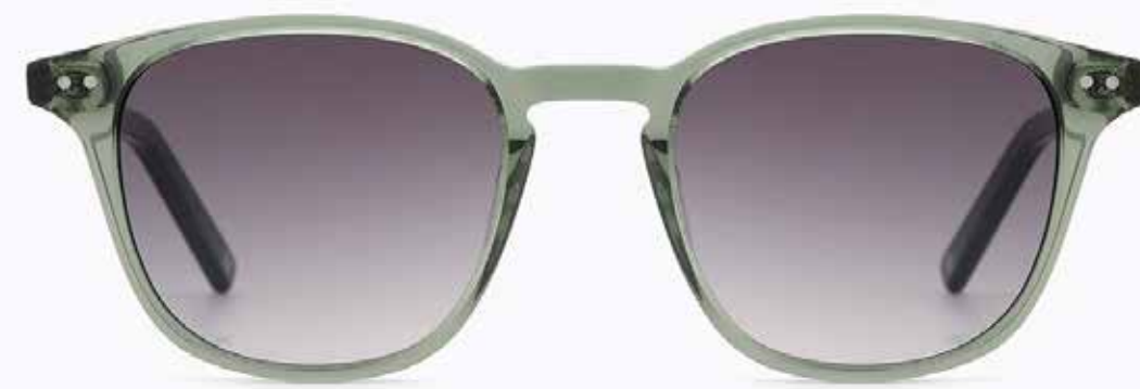
CL9207 SG 02

Frame Color: Trans olive Lens Color: Gradient smoke Frame Material: Hand made - Acetate Handle Length: 140 Lens Width: 48 Nose Bridge: 20