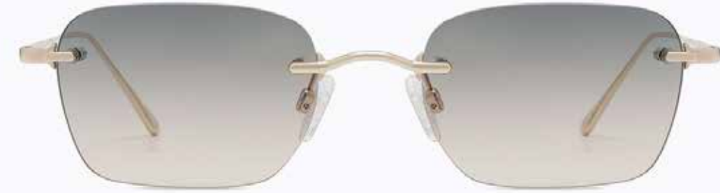
CL6800 SG 04

Frame Color: Gold Lens Color: Green to yellow Frame Material: Metal Handle Length: 145 Lens Width: 46 Nose Bridge: 22