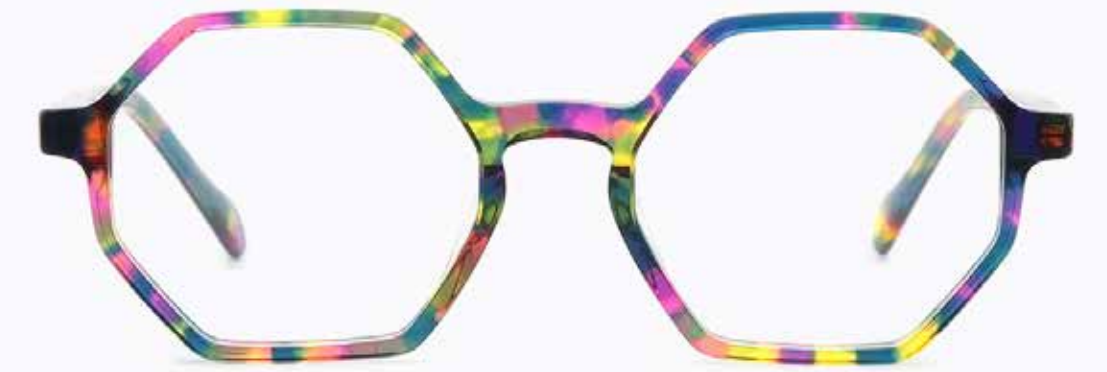
CL4256 OPT 03

Frame Color: Colorful demi Lens Color: 0 Frame Material: Hand made - Acetate Handle Length: 145 Lens Width: 49 Nose Bridge: 19