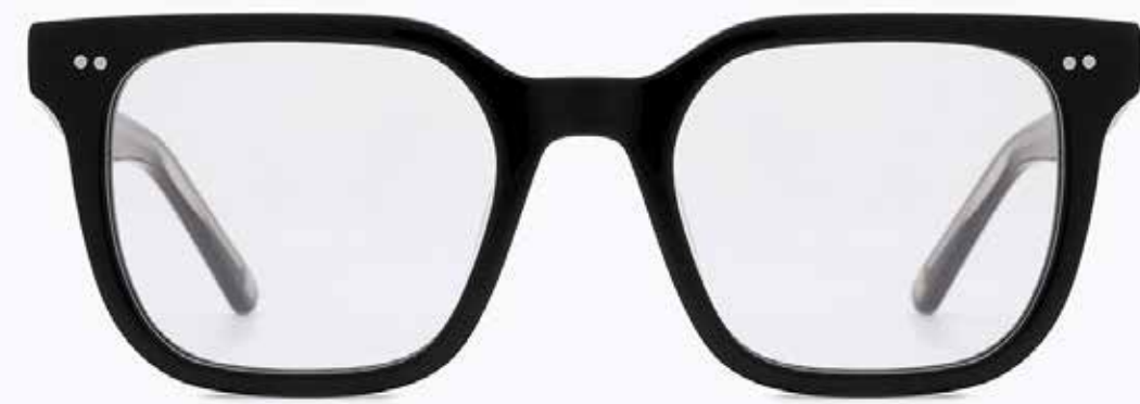
CL4250 OPT 01

Frame Color: Black Lens Color: 0 Frame Material: Hand made - Acetate Handle Length: 145 Lens Width: 49 Nose Bridge: 21