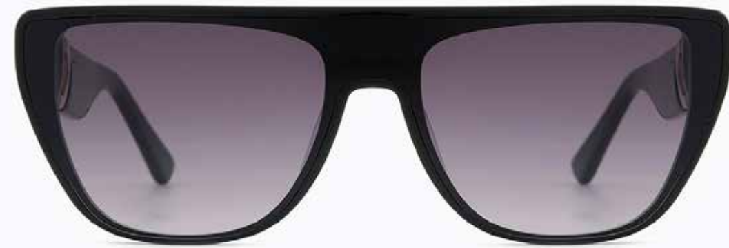
CL9176 SG 01

Frame Color: Shiny Black Lens Color: gradient smoke Frame Material: Hand made - Acetate Handle Length: 145 Lens Width: 137 Nose Bridge: 0