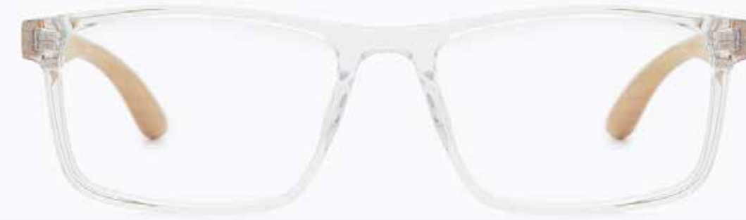
CL4304 OPT 02

Frame Color: Transparent Lens Color: 0 Frame Material: Hand made- Acetate Handle Length: 145 Lens Width: 54 Nose Bridge: 17