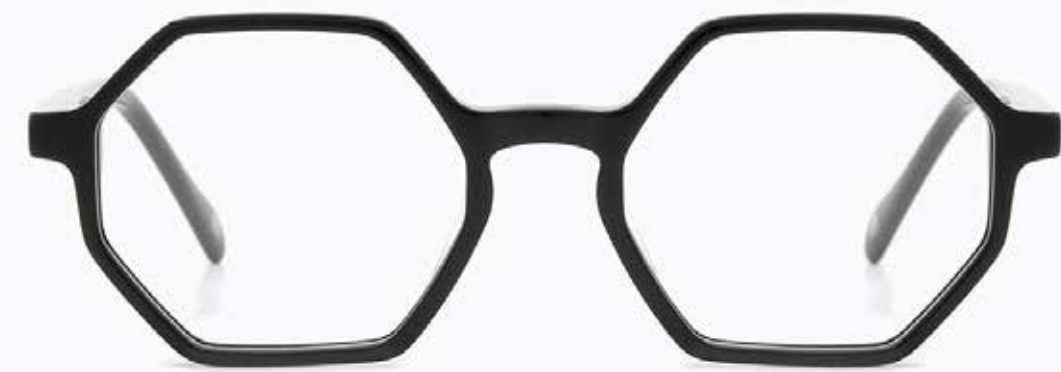
CL4256 OPT 01

Frame Color: Shiny black Lens Color: 0 Frame Material: Hand made - Acetate Handle Length: 145 Lens Width: 49 Nose Bridge: 19