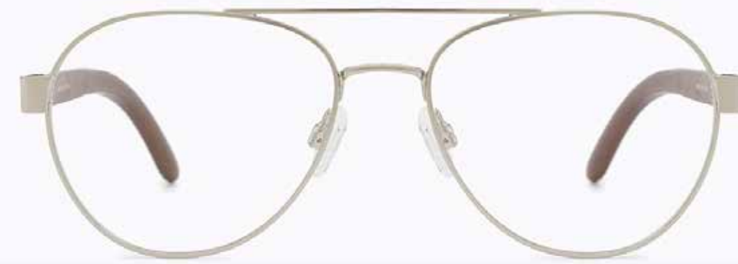
CL4310 OPT 02

Frame Color: silver Lens Color: 0 Frame Material: Metal Handle Length: 140 Lens Width: 54 Nose Bridge: 17