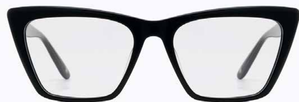
CL4204 OPT 01

Frame Color: Black Lens Color: 0 Frame Material: Hand made - Acetate Handle Length: 145 Lens Width: 52 Nose Bridge: 17