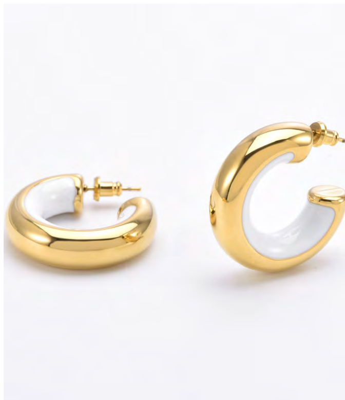
VX149 Lotus Earrings - White