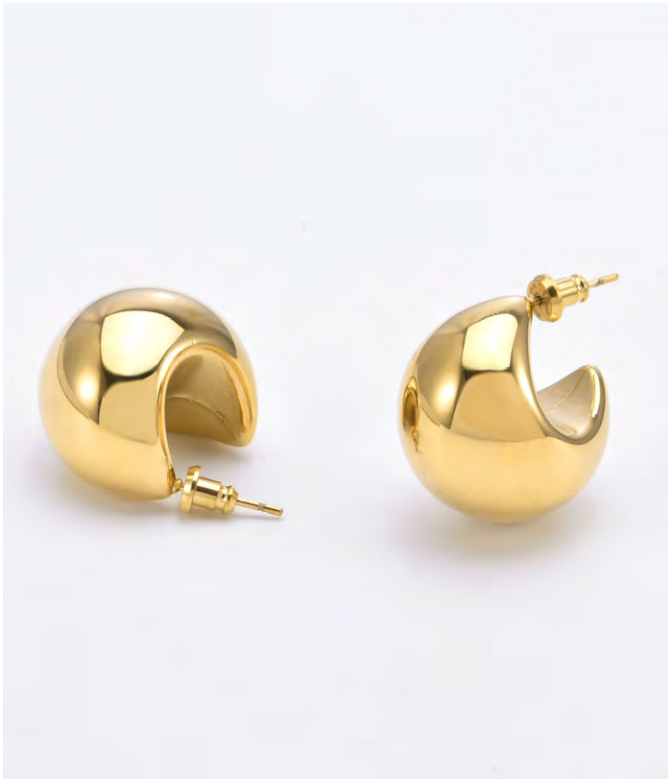
VX131- Orbit Earrings - Gold