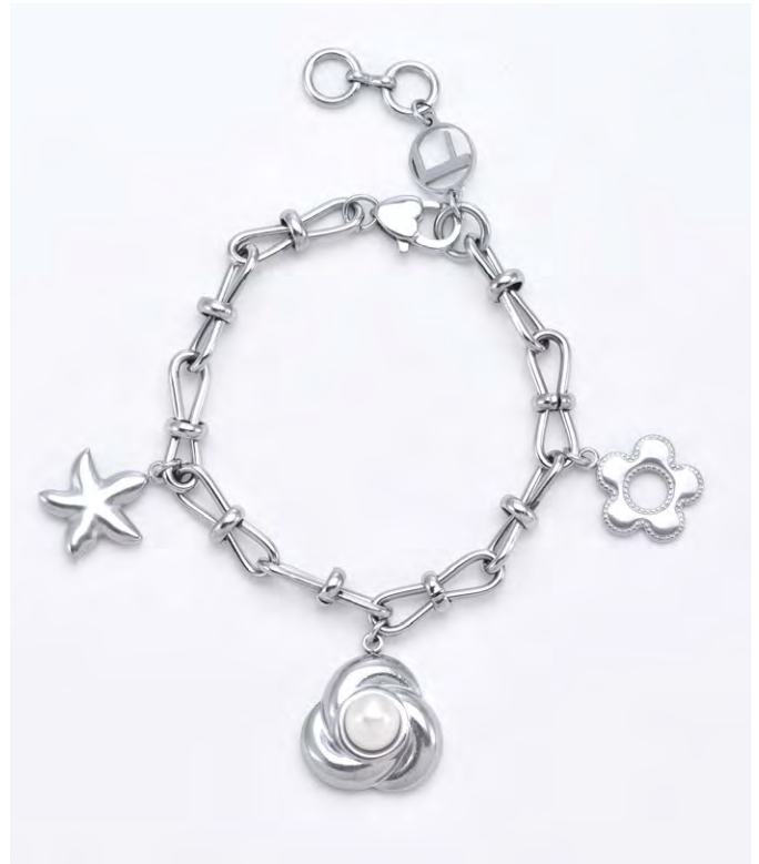
YB0182 - 190 Daisy Bracelet - Silver