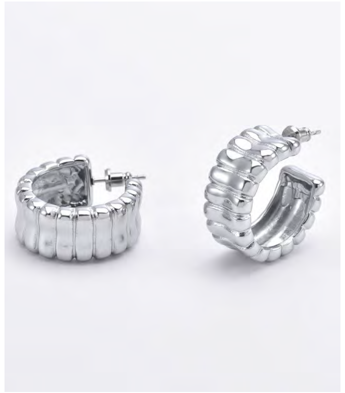
VX121 Arch Earrings - Gold