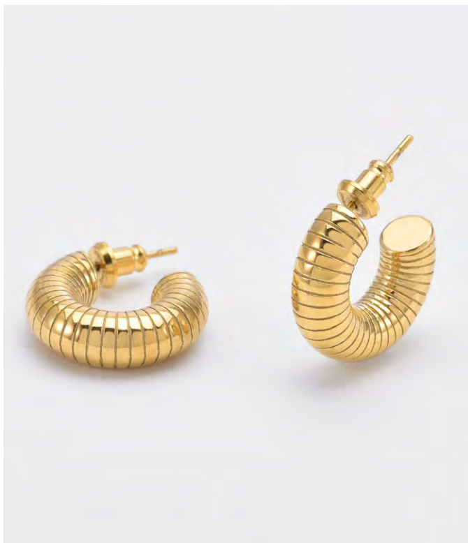
VX061 Daisy Earrings - Gold