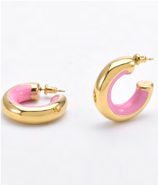
VX145 Lotus Earrings - Pink