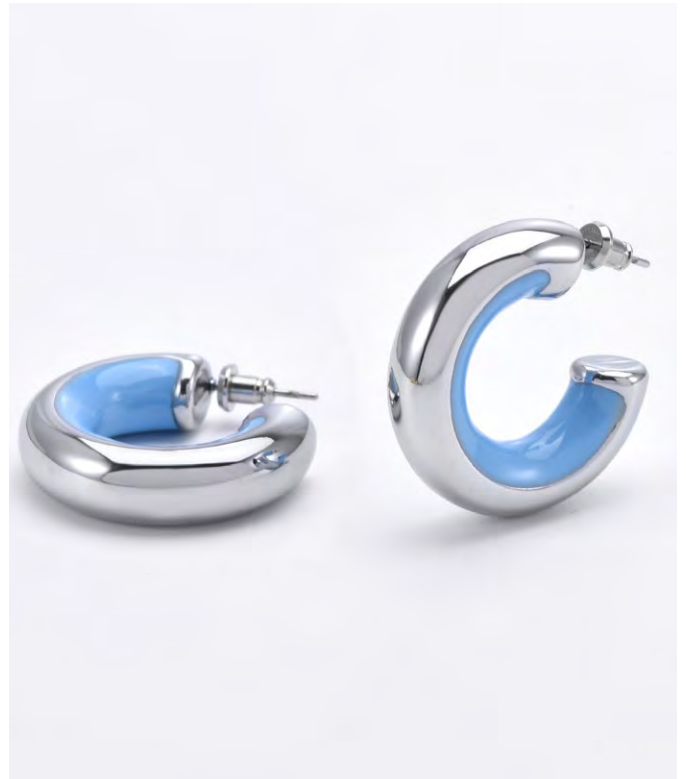
VX146 Lotus Earrings - Blue