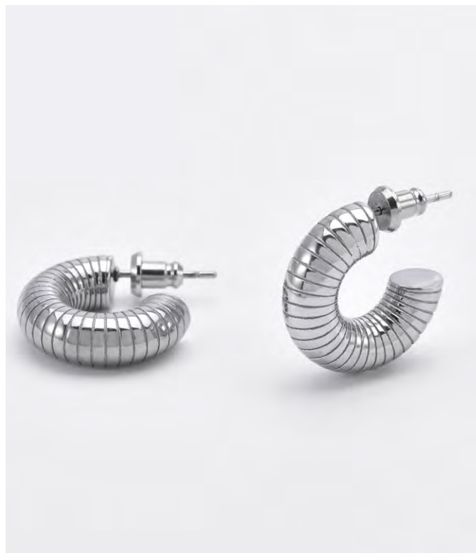
VX062 Daisy Earrings - Silver