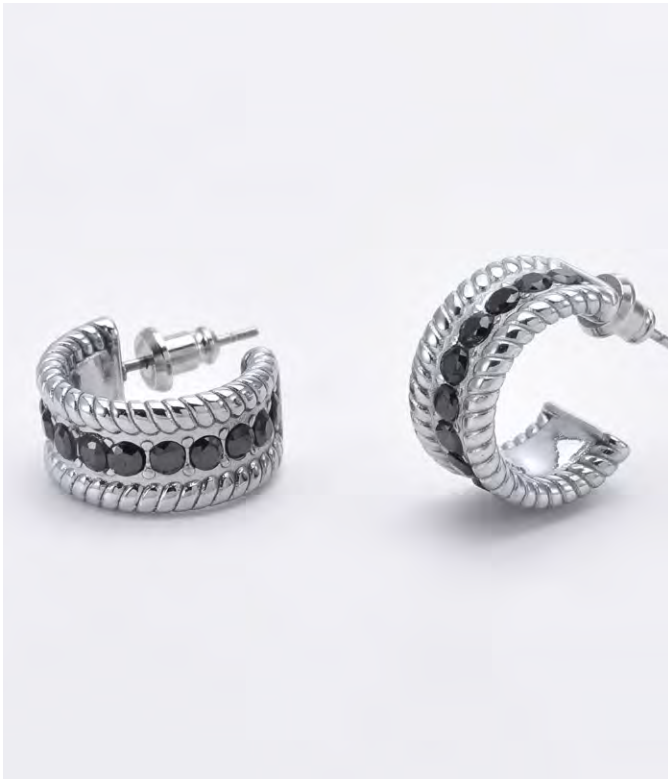
VX083 Suki Earrings - Black