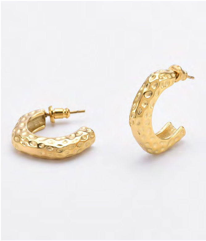
VX091 Mia Earrings - Gold