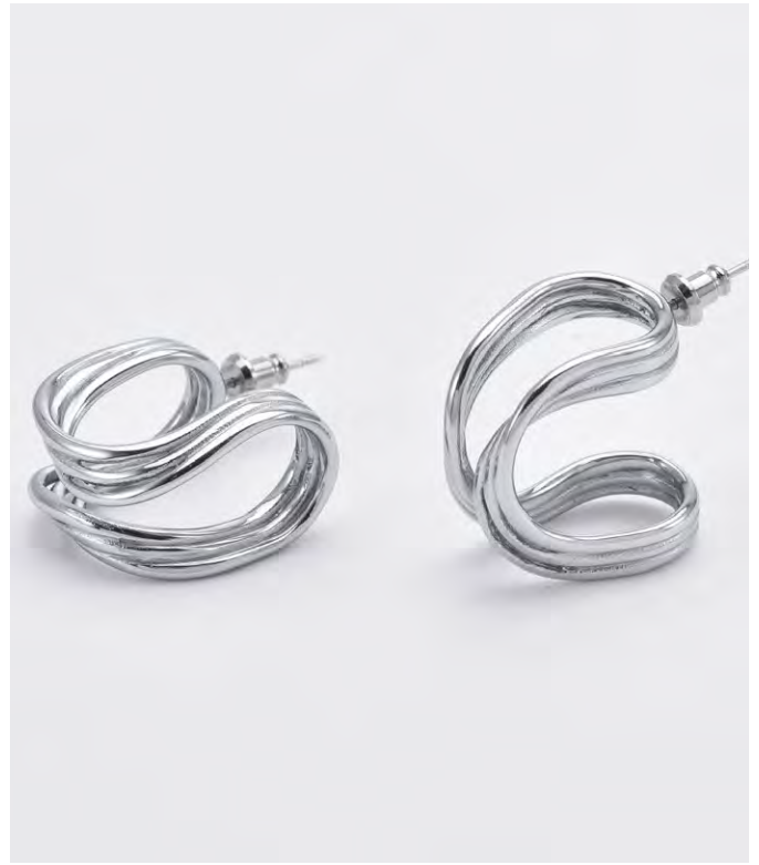
VX112 Portrait Earrings - Silver