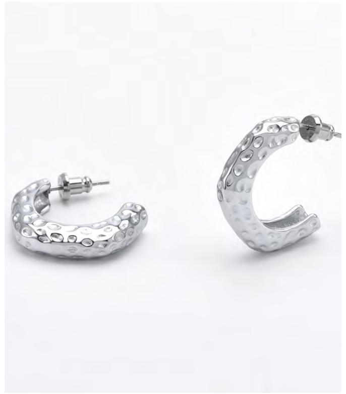
VX092 Mia Earrings - Silver