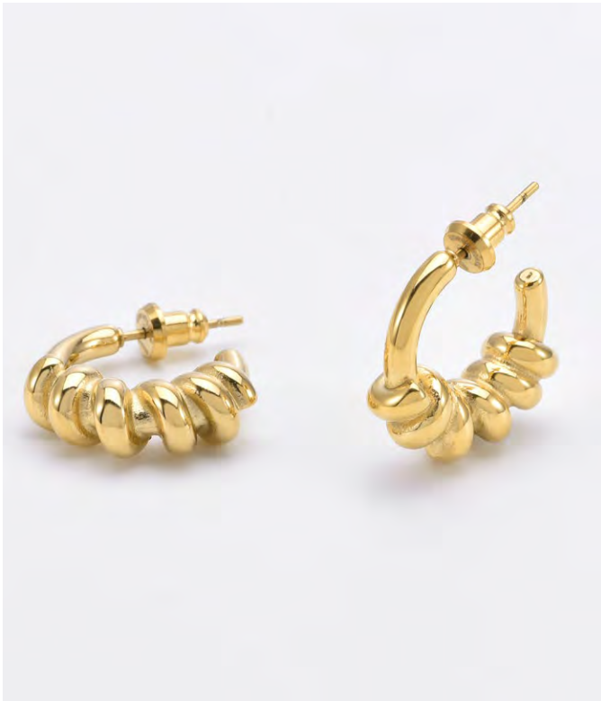
VX071 Swirl Earrings - Gold