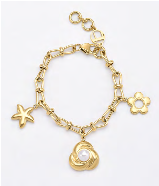
YB0181 - 190 Daisy Bracelet - Gold