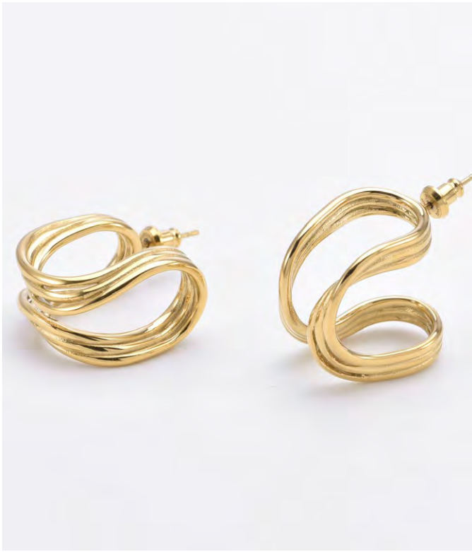
VX111 Portrait Earrings - Gold