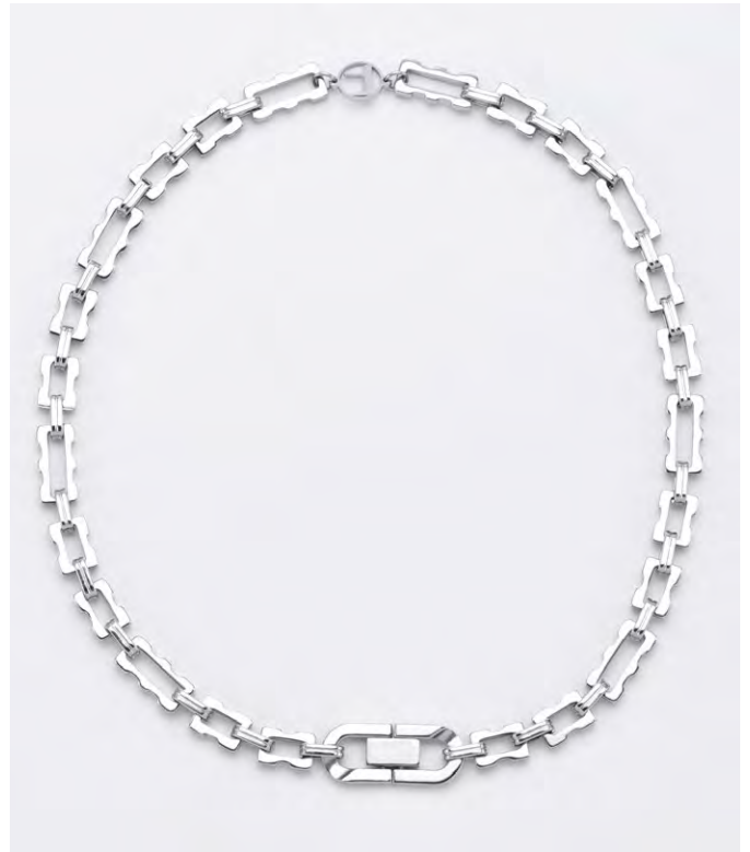
YN0171 - 430 Links Necklace - Gold