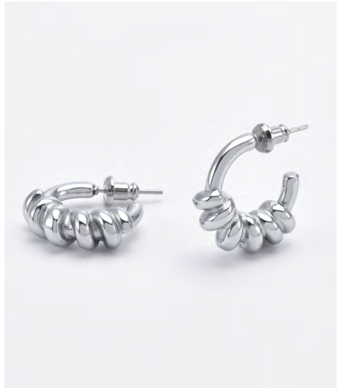
VX072 Swirl Earrings - Silver