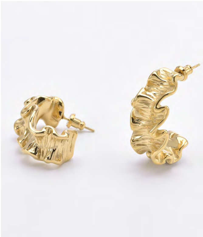
VX101 Athena Earrings - Gold