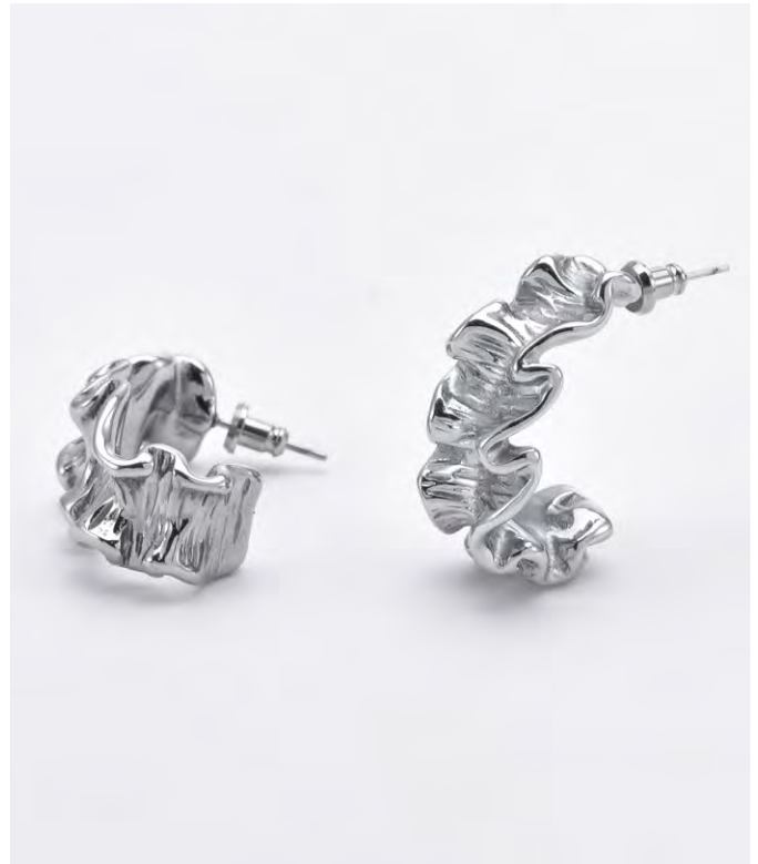
VX102 Athena Earrings - Silver