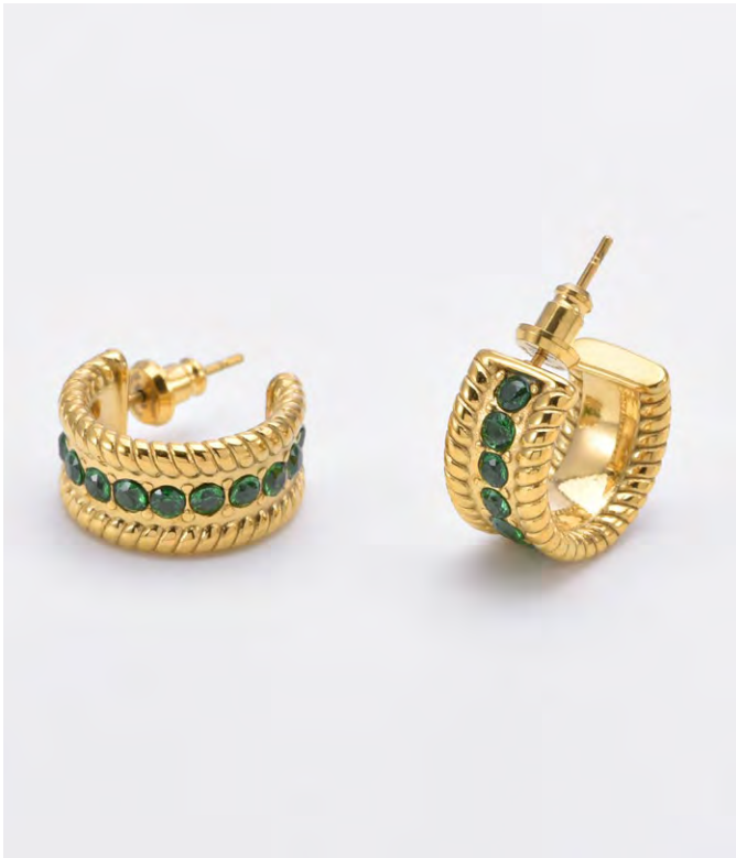
VX087 Suki Earrings - Green