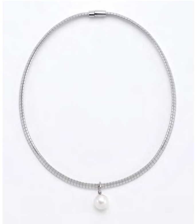
YN0191 - 430 Orbit Necklace - Gold