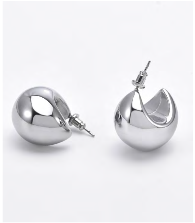
VX132 Orbit Earrings - Silver